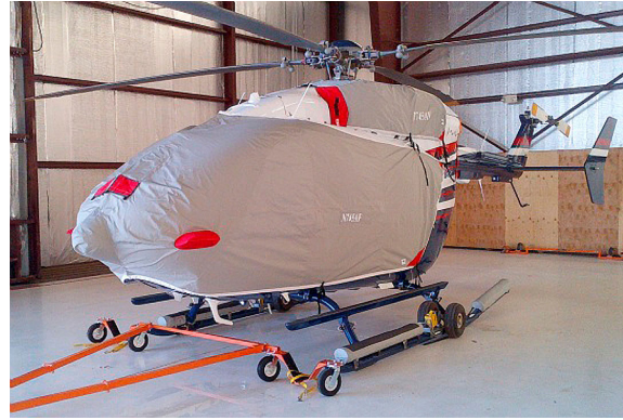
Bubble Cover w/ nose mounted radome & Upper Deck Plugs/Cover