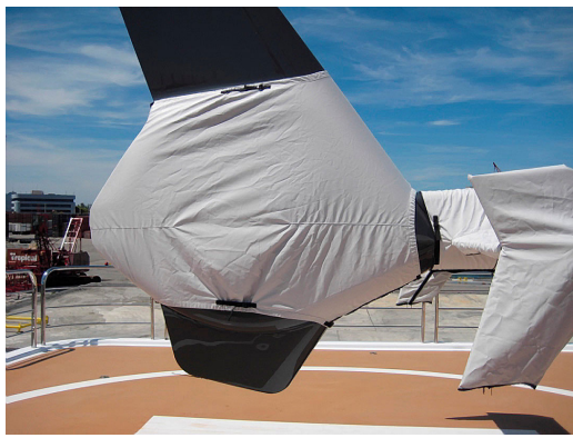
EC-135 Tailfan Cover and Tailboom Stabilizer Cover