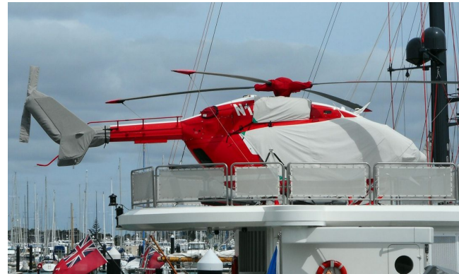
Eurocopter EC-135 Bubble, Engine, Rotor Hub, Tail Surfaces Covers