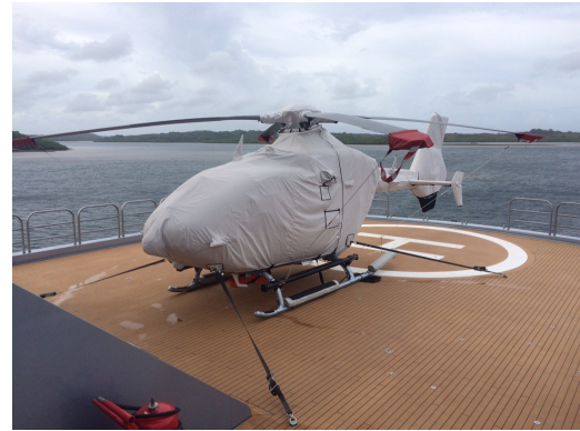
Eurocopter EC-135 Full Body Covers