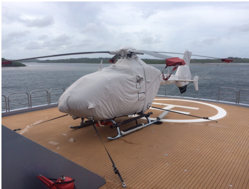
Eurocopter EC-135 Full Body Covers

The Tailboom Cover details vary by model, but generally the helicopter tail boom cover encloses the tail boom from the "bottleneck" to the aft end. They usually also cover the horizontal stabilizers, and are custom made to allow for antennae, lights, and other protrusions. They attach with straps underneath the tail boom. Covers for the vertical and horizontal stabilizers are also available separately. Specific information for each model is available on request.