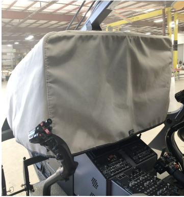
Eurocopter EC-135 Instrument Panel Heatshield Cover

Heatshields are interior sunshades for an aircraft's windows or canopy glass. The product is a unique composite of closed-cell foam with a silver mylar finish. The semi-rigid design is stiff enough to stand along the inside of the windshield using sun visors or window framing. It folds up flat and easily stores in the included storage sleeve. Some designs may require velcro and suction cups. A Heatshield is an excellent short-term remedy for cockpit overheating.