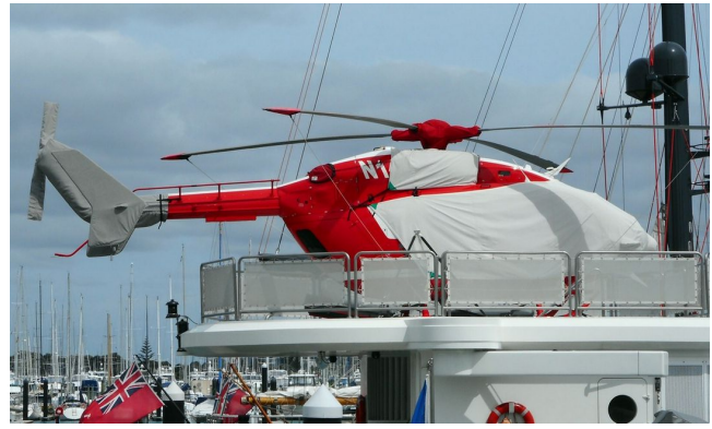
EC-135 Windshield/Skylights Cover, pinches in door jambs Eurocopter EC-135 Bubble, Engine, Rotor Hub, Tail Surfaces Covers