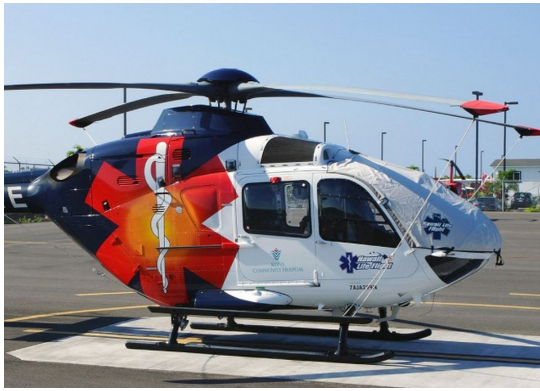
Eurocopter EC-135 Windshield/Skylight Cover