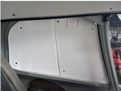
Airbus Helicopter EC130 B4 Side Window Heatshields