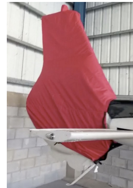
Eurocopter EC-130 Tailfan/Upper Vert Stab Housing Cover