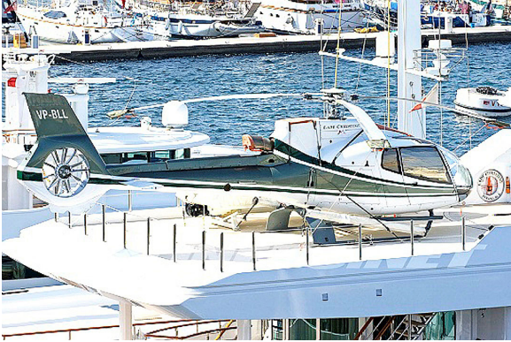
EC-130 Front, Side and Skylight Window HeatShields

Heatshields are interior sunshades for an aircraft's windows or canopy glass. The product is a unique composite of closed-cell foam with a silver mylar finish. The semi-rigid design is stiff enough to stand along the inside of the windshield using sun visors or window framing. It folds up flat and easily stores in the included storage sleeve. Some designs may require velcro and suction cups. A Heatshield is an excellent short-term remedy for cockpit overheating.