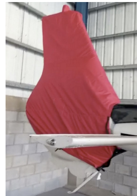
Eurocopter EC-130 Tailfan/Upper Vert Stab Housing Cover