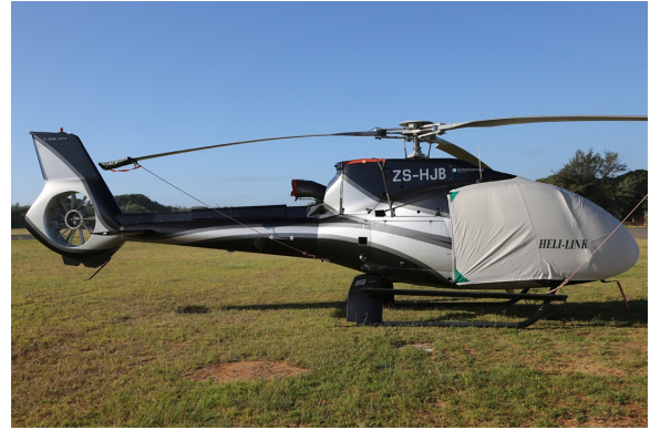
EC-130 Bubble Cover