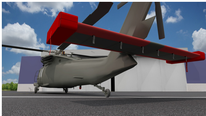
Padded Horizontal Stab Covers, Wingtip Pads (illustration)