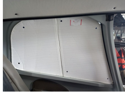
Airbus Helicopter H-130 Side Window Heatshields