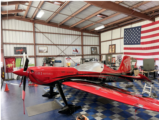
Gamebird GB-1 Solar Cap (single place), CUSTOM COVERS & IMPRINTING AVAILABLE!

This cover type is made from Silver Acrylic Sunbrella canvas and is 100% lined with a soft and smooth microfiber. Bruce's Custom Covers developed this material combination especially for aircraft protection. The outer material is medium weight and treated for water resistance, UV resistance and anti-static buildup. The inner lining is a very soft and smooth microfiber to prevent scratching. The material is very reflective, and tests show that the cabin interior temperature can be reduced to near-ambient temperature on the hottest of days. It is water, ice and snow repellent, yet breathable to allow moisture to escape from between the cover and the aircraft surface.