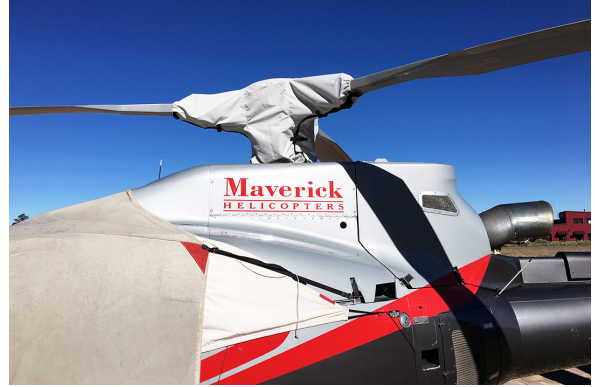
Eurocopter EC-130 Main Rotor Hub Cover