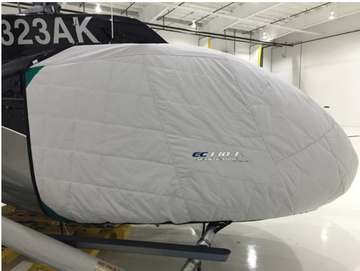
EC-130 Insulated Bubble Cover

This cover type is made from Silver Acrylic Sunbrella canvas and is 100% lined with a soft and smooth microfiber. Bruce's Custom Covers developed this material combination especially for aircraft protection. The outer material is medium weight and treated for water resistance, UV resistance and anti-static buildup. The inner lining is a very soft and smooth microfiber to prevent scratching. The material is very reflective, and tests show that the cabin interior temperature can be reduced to near-ambient temperature on the hottest of days. It is water, ice and snow repellent, yet breathable to allow moisture to escape from between the cover and the aircraft surface.