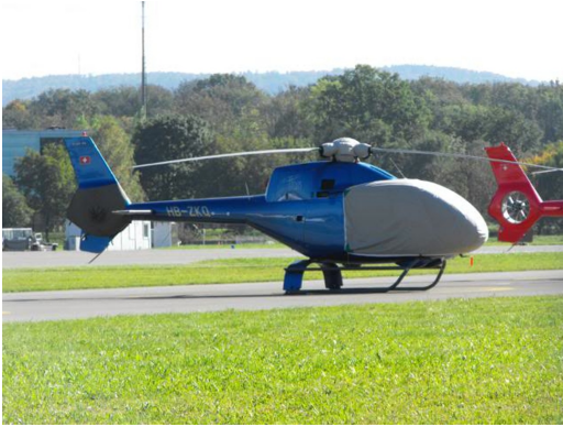
EC-130 Bubble, Tailfan, and Rotor Hub Cover

This cover type is made from Silver Acrylic Sunbrella canvas and is 100% lined with a soft and smooth microfiber. Bruce's Custom Covers developed this material combination especially for aircraft protection. The outer material is medium weight and treated for water resistance, UV resistance and anti-static buildup. The inner lining is a very soft and smooth microfiber to prevent scratching. The material is very reflective, and tests show that the cabin interior temperature can be reduced to near-ambient temperature on the hottest of days. It is water, ice and snow repellent, yet breathable to allow moisture to escape from between the cover and the aircraft surface.