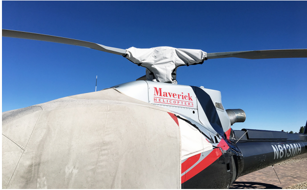
Eurocopter EC-130 Main Rotor Hub Cover

circulation and drainage in freezing weather. Some part numbers have features for an extra charge.