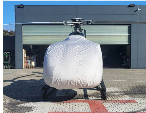
Airbus Helicopter H-130 Bubble Cover, Extends To Cover Fwd Engine Inlet