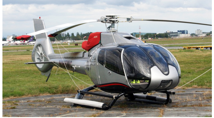
Intake/Exhaust Cover, Rotor Hub Cover (w/ skirt) & Blade Tie Downs