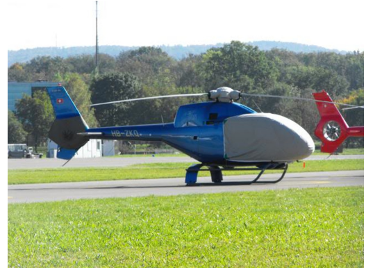
EC-130 Bubble, Tailfan, and Rotor Hub Cover