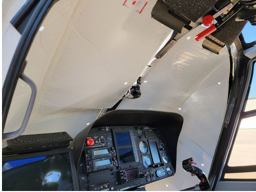
Eurocopter EC-120 Windshield HeatShields

Heatshields are interior sunshades for an aircraft's windows or canopy glass. The product is a unique composite of closed-cell foam with a silver mylar finish. The semi-rigid design is stiff enough to stand along the inside of the windshield using sun visors or window framing. It folds up flat and easily stores in the included storage sleeve. Some designs may require velcro and suction cups. A Heatshield is an excellent short-term remedy for cockpit overheating.