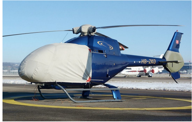
Eurocopter EC-120 Bubble, Rotor Mast & Tailfan Covers