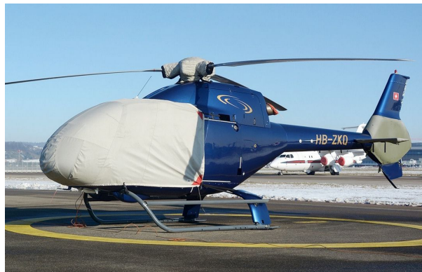
Eurocopter EC-120 Bubble, Rotor Mast & Tailfan Covers