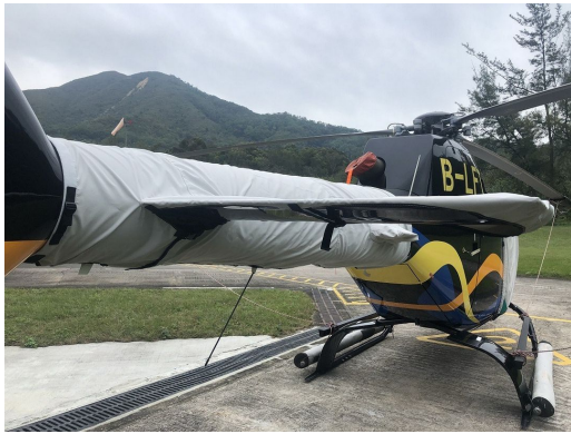
Eurocopter EC-120B Tailboom Cover

The Tailboom Cover details vary by model, but generally the helicopter tail boom cover encloses the tail boom from the "bottleneck" to the aft end. They usually also cover the horizontal stabilizers, and are custom made to allow for antennae, lights, and other protrusions. They attach with straps underneath the tail boom. Covers for the vertical and horizontal stabilizers are also available separately. Specific information for each model is available on request.