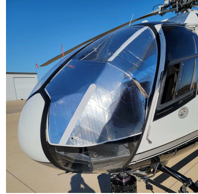
Eurocopter EC-120 Windshield HeatShields