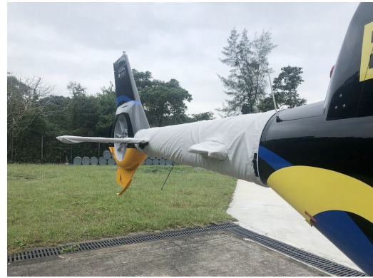
Eurocopter EC-120B Tailboom Cover