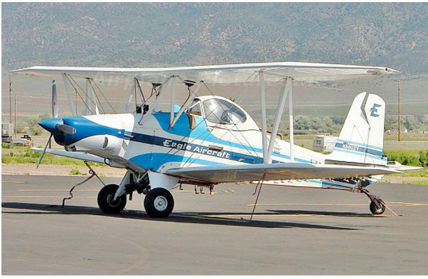
Covers for the Eagle DW-1