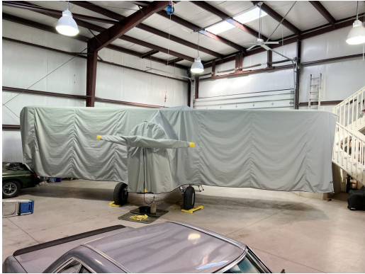
Stearman PT-13 Full Body Dust Cover

Some high value aircraft end up logging lots of hangar time, and become dust magnets in the process. A high quality, well fitting dust cover provides easy assurance that the aircraft's surfaces remain clean and free of grit and grime. Available in a large variety of colors, each dust cover is custom made according to aircraft details and customer preferences. Fire retardant fabrics are also available.