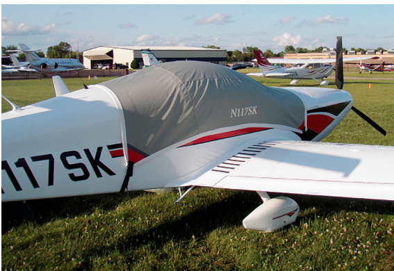
Dova Skylark Standard Canopy Cover

This cover type is made from Silver Acrylic Sunbrella canvas and is 100% lined with a soft and smooth microfiber. Bruce's Custom Covers developed this material combination especially for aircraft protection. The outer material is medium weight and treated for water resistance, UV resistance and anti-static buildup. The inner lining is a very soft and smooth microfiber to prevent scratching. The material is very reflective, and tests show that the cabin interior temperature can be reduced to near-ambient temperature on the hottest of days. It is water, ice and snow repellent, yet breathable to allow moisture to escape from between the cover and the aircraft surface.