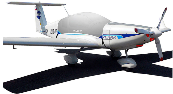
Dova Skylark Standard Canopy Cover and Engine Plugs (illustration)