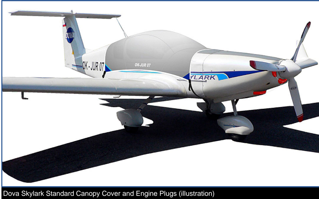
Dova Skylark Standard Canopy Cover and Engine Plugs (illustration)