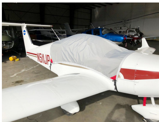
Dova Skylark DV-1 Travel Cover, Light Weight Canopy Cover