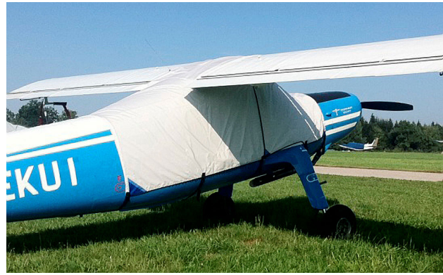
Dornier Do27 Canopy Cover, over-top type