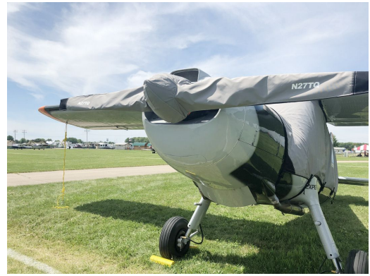
Dornier DO-27 Canopy Cover, Prop Cover