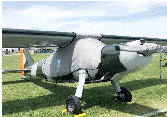
Dornier DO-27 Canopy Cover, Prop Cover