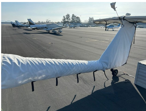
Dimona HK-36 Empennage Cover Set

WINTER USE MATERIAL - Made with Solution-Dyed Polyester fabric, this option is intended for seasonal use to aid in deicing, rain mitigation, or for occasional travel. The material is lighter and more compact, but more susceptible to UV damage and may have a shorter useful life if used continuously outside than the all-year use material.