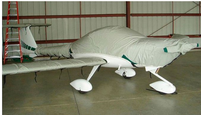
DA-20 Canopy/Engine, Prop/Spinner, Wing, Tailboom, Horiz. Stab. Covers