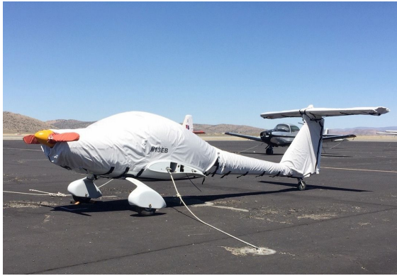
Dimona HK-36 Extended Canopy/Engine Cover, Empennage Cover Set

The Diamond HK-36, Super Dimona & Extreme Canopy/Engine Cover is a one-piece cover (100% lined with microfiber) that is a combination of the Canopy Cover and Engine Cover. This cover will enclose the engine cowl and will extend aft to cover all of the windows. This cover type is made from Silver Acrylic Sunbrella canvas and is 100% lined with a soft and smooth microfiber. Bruce's Custom Covers developed this material combination especially for aircraft protection. The outer material is medium weight and treated for water resistance, UV resistance and anti-static buildup. The inner lining is a very soft and smooth microfiber to prevent scratching. The material is very reflective, and tests show that the cabin interior temperature can be reduced to near-ambient temperature on the hottest of days. It is water, ice and snow repellent, yet breathable to allow moisture to escape from between the cover and the aircraft surface.