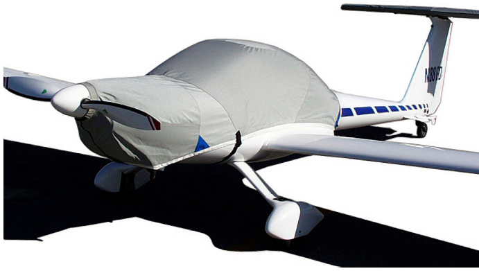
Diamond DA-20 Canopy/Engine Cover