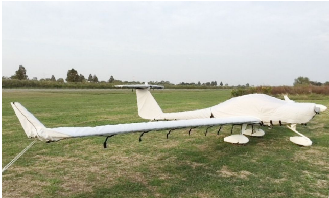
Diamond Super Dimona Cover Set

The Diamond HK-36, Super Dimona & Extreme Canopy/Engine Cover is a one-piece cover (100% lined with microfiber) that is a combination of the Canopy Cover and Engine Cover. This cover will enclose the engine cowl and will extend aft to cover all of the windows. This cover type is made from Silver Acrylic Sunbrella canvas and is 100% lined with a soft and smooth microfiber. Bruce's Custom Covers developed this material combination especially for aircraft protection. The outer material is medium weight and treated for water resistance, UV resistance and anti-static buildup. The inner lining is a very soft and smooth microfiber to prevent scratching. The material is very reflective, and tests show that the cabin interior temperature can be reduced to near-ambient temperature on the hottest of days. It is water, ice and snow repellent, yet breathable to allow moisture to escape from between the cover and the aircraft surface.