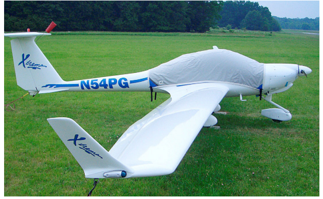
Dimona Xtreme Canopy Cover