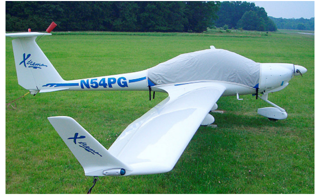
Dimona Xtreme Canopy Cover