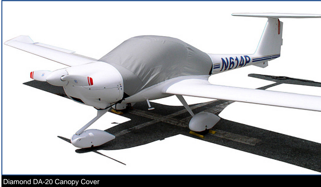
Diamond DA-20 Canopy Cover