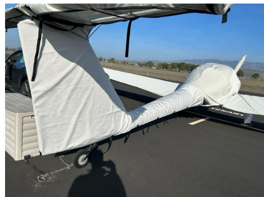
Dimona HK-36 Empennage Cover Set