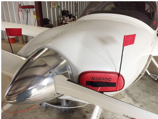
Diamond DA-20-C1 Engine Inlet Plugs

This cover type is made from Silver Acrylic Sunbrella canvas and is 100% lined with a soft and smooth microfiber. Bruce's Custom Covers developed this material combination especially for aircraft protection. The outer material is medium weight and treated for water resistance, UV resistance and anti-static buildup. The inner lining is a very soft and smooth microfiber to prevent scratching. The material is very reflective, and tests show that the cabin interior temperature can be reduced to near-ambient temperature on the hottest of days. It is water, ice and snow repellent, yet breathable to allow moisture to escape from between the cover and the aircraft surface.