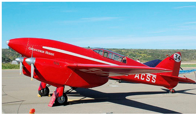
Cockpit Cover for the De Havilland Comet Racer