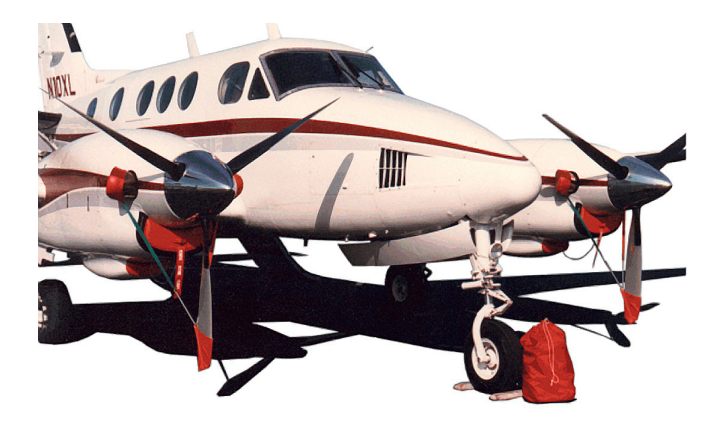
Pitot, Exhaust Covers, Engine Plugs & Prop Ties

Engine Inlet Plugs are custom fit for your DeHavilland Dash 7 Combi intakes, made with heavy-duty vinyl material, and stuffed with a single block of sculpted urethane foam. Each plug has a zipper that allows the foam to be removed and dried if necessary. Engine plugs have warning flags that are visible from the cockpit or 'remove before flight' streamers sewn onto the face of the plugs. Most plugs are imprinted with the aircraft registration number in black for an extra charge. Storage bag NOT included. Engine plugs may be inserted after flight when the engine is still warm. Engine Inlet Plugs are commonly referred to as Cowl Plugs, Intake Plugs, Cowl Blocks, Engine Blocks, and Engine Bungs.