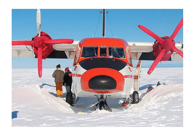
Casa 212 Insulated Engine & Propellor/Spinner Covers