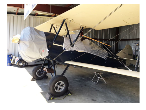
Travel Air 4000 Canopy and Engine Covers, light weight travel Travel Air 4000 Canopy and Engine Covers, light weight travel type