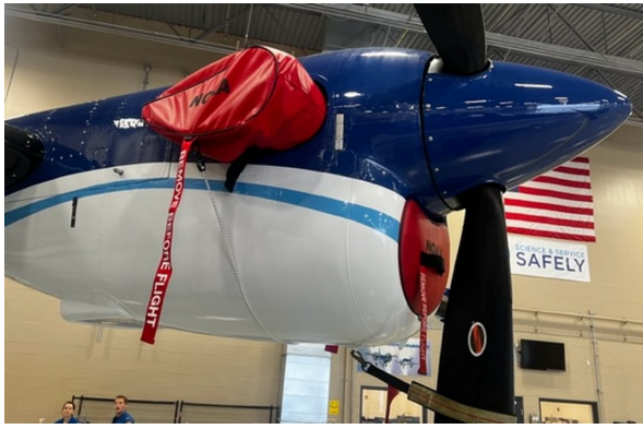
DeHavilland Twin Otter DHC6 Intake Plug, Exhaust Covers