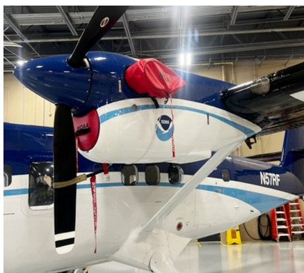
DeHavilland Twin Otter DHC6 Intake Plug, Exhaust Covers