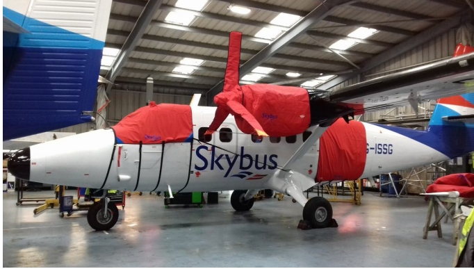
DeHavilland Twin Otter DHC6 (UV-18A) Cockpit Cover (CUSTOM COLOR)

water resistance, UV resistance and anti-static buildup. The inner lining is a very soft and smooth microfiber to prevent scratching. The material is very reflective, and tests show that the cabin interior temperature can be reduced to near-ambient temperature on the hottest of days. It is water, ice and snow repellent, yet breathable to allow moisture to escape from between the cover and the aircraft surface.