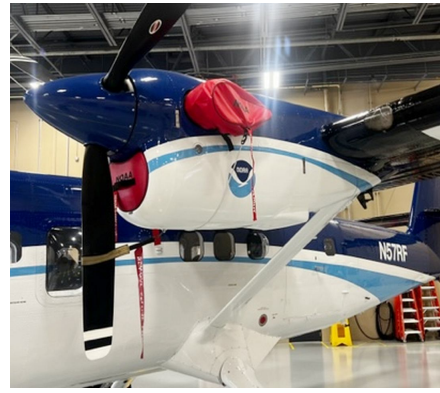
DeHavilland Twin Otter DHC6 Intake Plug, Exhaust Covers