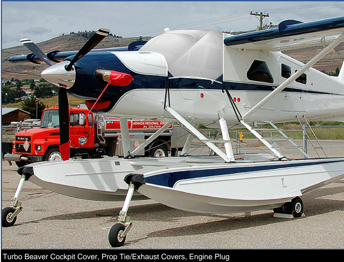
Turbo Beaver Cockpit Cover, Prop Tie/Exhaust Covers, Engine Plug