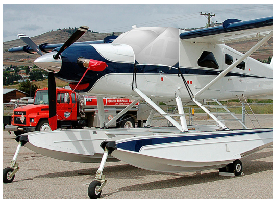
Turbo Beaver Cockpit Cover, Prop Tie/Exhaust Covers, Engine Plug