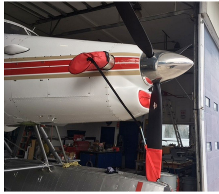
DeHavilland Turbin Otter Intake plugs, Prop Tie/Exhaust Covers