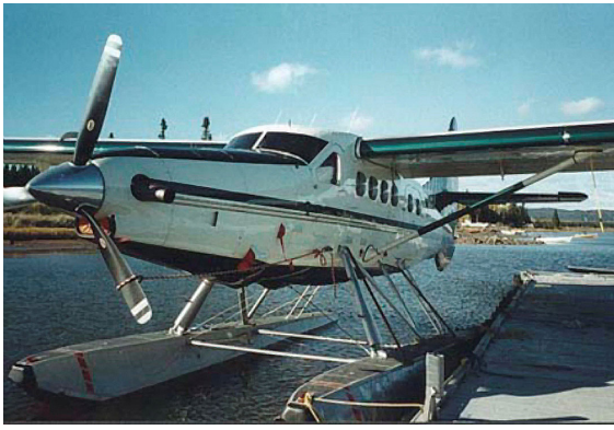
Covers & Plugs for the Turbine Otter