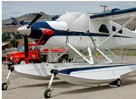
Turbo Beaver Cockpit Cover, Prop Tie/Exhaust Covers, Engine Plug

This cover type is made from Silver Acrylic Sunbrella canvas and is 100% lined with a soft and smooth microfiber. Bruce's Custom Covers developed this material combination especially for aircraft protection. The outer material is medium weight and treated for water resistance, UV resistance and anti-static buildup. The inner lining is a very soft and smooth microfiber to prevent scratching. The material is very reflective, and tests show that the cabin interior temperature can be reduced to near-ambient temperature on the hottest of days. It is water, ice and snow repellent, yet breathable to allow moisture to escape from between the cover and the aircraft surface.