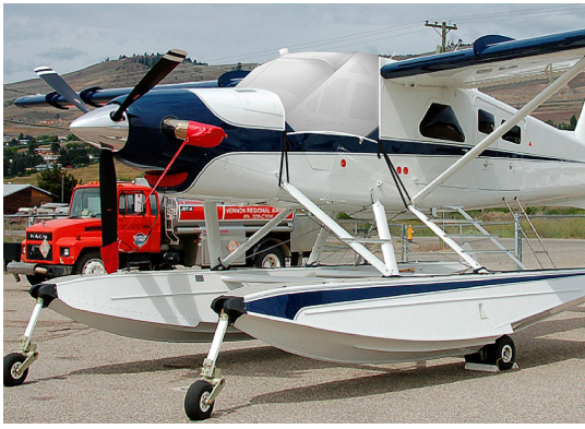
Turbo Beaver Cockpit Cover, Prop Tie/Exhaust Covers, Engine Plug