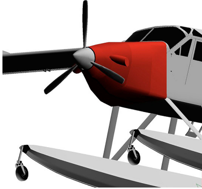
Turbo Beaver Insulated Engine Cover, 3D model

The material is very reflective, and tests show that the cabin interior temperature can be reduced to near-ambient temperature on the hottest of days. It is water, ice and snow repellent, yet breathable to allow moisture to escape from between the cover and the aircraft surface.