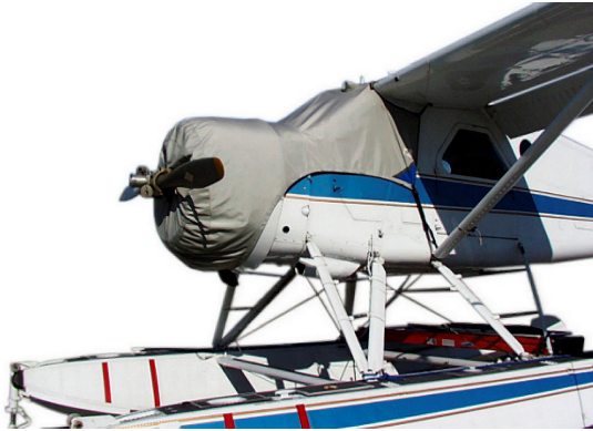
Beaver Windshield/Engine Cover