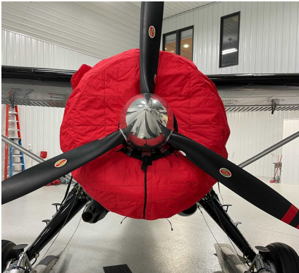
DeHavilland Beaver Insulated Engine Cover

This cover type is made from Silver Acrylic Sunbrella canvas and is 100% lined with a soft and smooth microfiber. Bruce's Custom Covers developed this material combination especially for aircraft protection. The outer material is medium weight and treated for water resistance, UV resistance and anti-static buildup. The inner lining is a very soft and smooth microfiber to prevent scratching. The material is very reflective, and tests show that the cabin interior temperature can be reduced to near-ambient temperature on the hottest of days. It is water, ice and snow repellent, yet breathable to allow moisture to escape from between the cover and the aircraft surface.