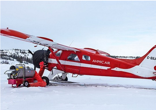
DeHavilland DH-2 Beaver Insulated Engine Cover