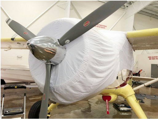
De Havilland Beaver Canopy/Engine Cover, test fit cover

This cover type is made from Silver Acrylic Sunbrella canvas and is 100% lined with a soft and smooth microfiber. Bruce's Custom Covers developed this material combination especially for aircraft protection. The outer material is medium weight and treated for water resistance, UV resistance and anti-static buildup. The inner lining is a very soft and smooth microfiber to prevent scratching. The material is very reflective, and tests show that the cabin interior temperature can be reduced to near-ambient temperature on the hottest of days. It is water, ice and snow repellent, yet breathable to allow moisture to escape from between the cover and the aircraft surface.