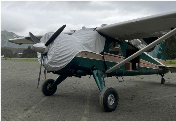
DeHavilland DH-2 Beaver Cockpit/Engine Cover