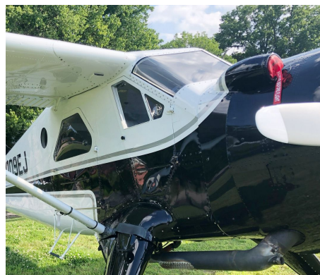
DeHavilland DH-2 Upper Cowling Air Scoop Plug