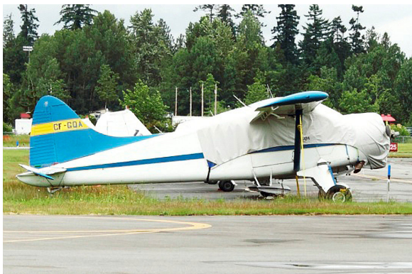
Beaver Canopy/Engine Cover

Travel Covers are made with Silver Solution-Dyed Polyester fabric and only lined over the windshield to save weight. The material is lightweight and more compact for easy stowage in the aircraft. The polyester material is water resistant, but only intended for occasional use outside. We also have an ultra lightweight material available for fitted hangar dust covers. For daily outdoor use, the non-travel Sunbrella Cover is the best choice.