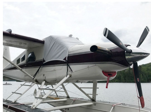
DeHavilland Turbo Beaver Cockpit Cover and Inlet Plug