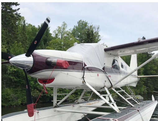
DeHavilland Turbo Beaver Cockpit Cover and Inlet Plug

Engine Inlet Plugs are custom fit for your DeHavilland Beaver DHC-2, U-6A, U-6B intakes, made with heavy-duty vinyl material, and stuffed with a single block of sculpted urethane foam. Each plug has a zipper that allows the foam to be removed and dried if necessary. Engine plugs have warning flags that are visible from the cockpit or 'remove before flight' streamers sewn onto the face of the plugs. Most plugs are imprinted with the aircraft registration number in black for an extra charge. Storage bag NOT included. Engine plugs may be inserted after flight when the engine is still warm. Engine Inlet Plugs are commonly referred to as Cowl Plugs, Intake Plugs, Cowl Blocks, Engine Blocks, and Engine Bungs.