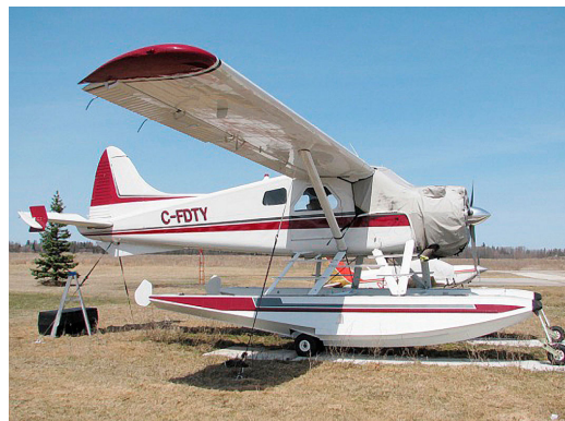
Beaver Windshield/Engine Cover