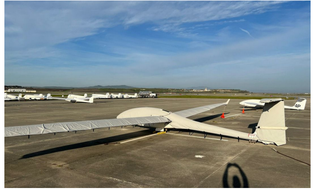
DG Flugzeugbau DG 1000S Complete Cover Set