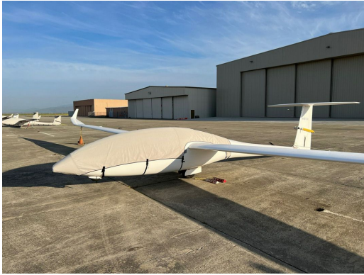
DG Flugzeugbau DG 1000S Canopy/Nose Cover w/turtledeck ext