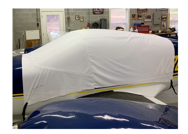
Wing Derringer Canopy Cover, test fit