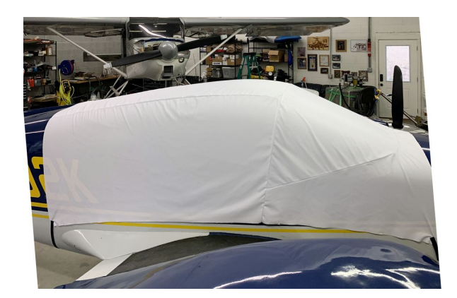
Wing Derringer Canopy Cover, test fit

This cover type is made from Silver Acrylic Sunbrella canvas and is 100% lined with a soft and smooth microfiber. Bruce's Custom Covers developed this material combination especially for aircraft protection. The outer material is medium weight and treated for water resistance, UV resistance and anti-static buildup. The inner lining is a very soft and smooth microfiber to prevent scratching. The material is very reflective, and tests show that the cabin interior temperature can be reduced to near-ambient temperature on the hottest of days. It is water, ice and snow repellent, yet breathable to allow moisture to escape from between the cover and the aircraft surface.