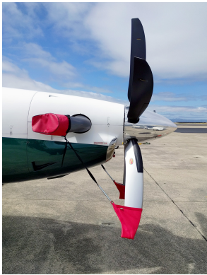
Pilatus PC-12 Prop Tie-Down/Exhaust Cover Set, 5 Blade

This cover type is made from Silver Acrylic Sunbrella canvas and is 100% lined with a soft and smooth microfiber. Bruce's Custom Covers developed this material combination especially for aircraft protection. The outer material is medium weight and treated for water resistance, UV resistance and anti-static buildup. The inner lining is a very soft and smooth microfiber to prevent scratching. The material is very reflective, and tests show that the cabin interior temperature can be reduced to near-ambient temperature on the hottest of days. It is water, ice and snow repellent, yet breathable to allow moisture to escape from between the cover and the aircraft surface.