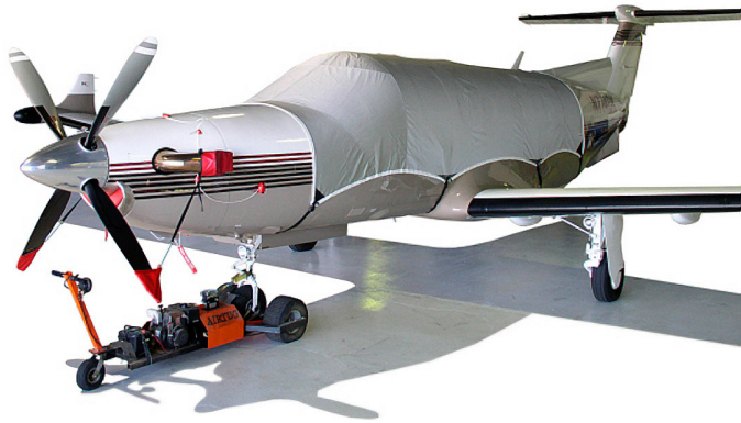
PC-12 Canopy Cover, Engine Plugs, Prop Tie/Exhaust Covers

Engine Inlet Plugs are custom fit for your Beech Denali 220 intakes, made with heavy-duty vinyl material, and stuffed with a single block of sculpted urethane foam. Each plug has a zipper that allows the foam to be removed and dried if necessary. Engine plugs have warning flags that are visible from the cockpit or 'remove before flight' streamers sewn onto the face of the plugs. Most plugs are imprinted with the aircraft registration number in black for an extra charge. Storage bag NOT included. Engine plugs may be inserted after flight when the engine is still warm. Engine Inlet Plugs are commonly referred to as Cowl Plugs, Intake Plugs, Cowl Blocks, Engine Blocks, and Engine Bungs.