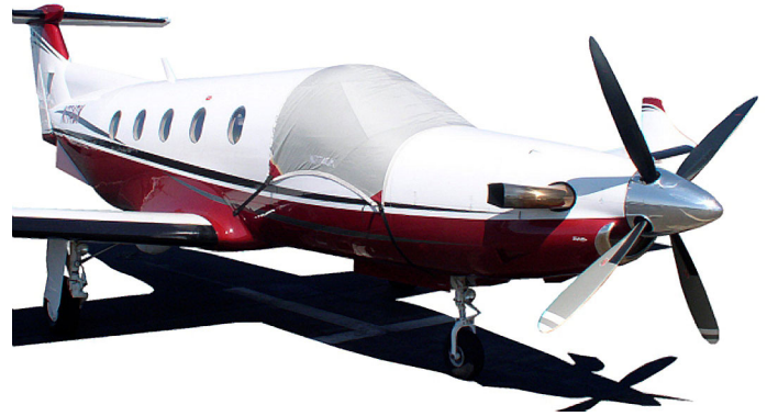
PC-12 Windshield Cover