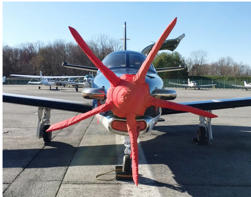
Socata TBM Insulated 5-Blade Prop/Spinner Cover