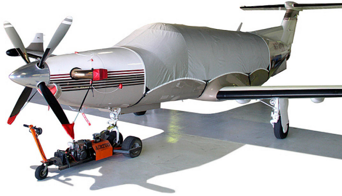
PC-12 Canopy Cover, Engine Plugs, Prop Tie/Exhaust Covers

This cover type is made from Silver Acrylic Sunbrella canvas and is 100% lined with a soft and smooth microfiber. Bruce's Custom Covers developed this material combination especially for aircraft protection. The outer material is medium weight and treated for water resistance, UV resistance and anti-static buildup. The inner lining is a very soft and smooth microfiber to prevent scratching. The material is very reflective, and tests show that the cabin interior temperature can be reduced to near-ambient temperature on the hottest of days. It is water, ice and snow repellent, yet breathable to allow moisture to escape from between the cover and the aircraft surface.