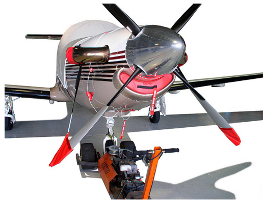
Pilatus PC-12 LARGE ENGINE INLET PLUG, SMALL PLUGS SET, Prop Tie/Exhaust Covers