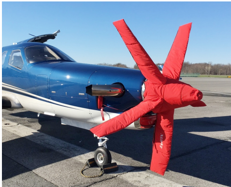
Socata TBM Insulated 5-Blade Prop/Spinner Cover

This cover type is made from Silver Acrylic Sunbrella canvas and is 100% lined with a soft and smooth microfiber. Bruce's Custom Covers developed this material combination especially for aircraft protection. The outer material is medium weight and treated for water resistance, UV resistance and anti-static buildup. The inner lining is a very soft and smooth microfiber to prevent scratching. The material is very reflective, and tests show that the cabin interior temperature can be reduced to near-ambient temperature on the hottest of days. It is water, ice and snow repellent, yet breathable to allow moisture to escape from between the cover and the aircraft surface.