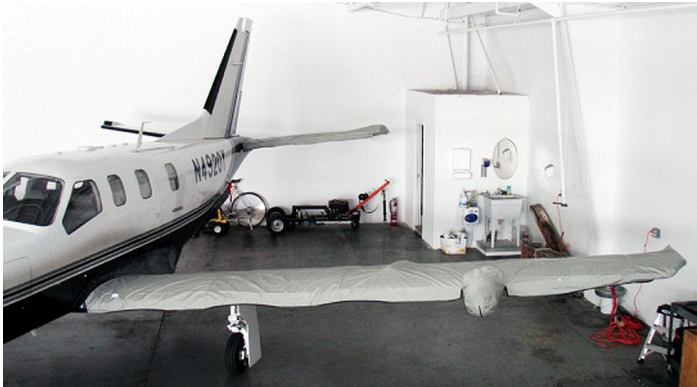
Pilatus PC-12 Wing Covers

WINTER USE MATERIAL - Made with Solution-Dyed Polyester fabric, this option is intended for seasonal use to aid in deicing, rain mitigation, or for occasional travel. The material is lighter and more compact, but more susceptible to UV damage and may have a shorter useful life if used continuously outside than the all-year use material.