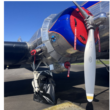
DC-3 Engine Plugs, Tire Covers