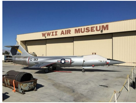
Lockheed F-104 Starfighter Canopy Cover, Single Seat Model