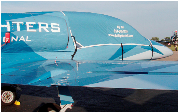
L-39 Canopy Cover & Plugs

This cover type is made from Silver Acrylic Sunbrella canvas and is 100% lined with a soft and smooth microfiber. Bruce's Custom Covers developed this material combination especially for aircraft protection. The outer material is medium weight and treated for water resistance, UV resistance and anti-static buildup. The inner lining is a very soft and smooth microfiber to prevent scratching. The material is very reflective, and tests show that the cabin interior temperature can be reduced to near-ambient temperature on the hottest of days. It is water, ice and snow repellent, yet breathable to allow moisture to escape from between the cover and the aircraft surface.