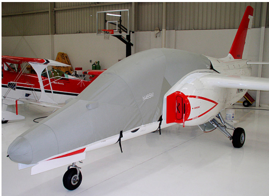
S-211 Canopy/Nose Cover & Engine Plugs