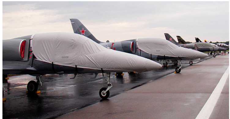
L-39 Canopy/Nose Covers & Plugs