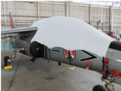
Dornier Alpha Jet Canopy Cover, test fit cover

This cover type is made from Silver Acrylic Sunbrella canvas and is 100% lined with a soft and smooth microfiber. Bruce's Custom Covers developed this material combination especially for aircraft protection. The outer material is medium weight and treated for water resistance, UV resistance and anti-static buildup. The inner lining is a very soft and smooth microfiber to prevent scratching. The material is very reflective, and tests show that the cabin interior temperature can be reduced to near-ambient temperature on the hottest of days. It is water, ice and snow repellent, yet breathable to allow moisture to escape from between the cover and the aircraft surface.