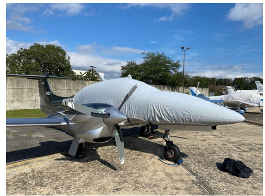
DA-62 Travel Canopy/Nose