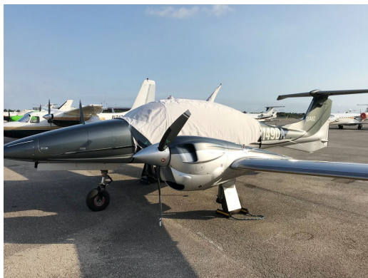
DIAMOND DA-62 CANOPY COVER