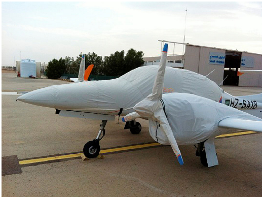
Diamond DA-42NG Canopy/Nose, Engine & Prop Covers