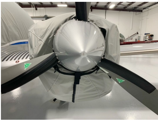
Diamond DA-62 Travel Weight Canopy & Engine Covers