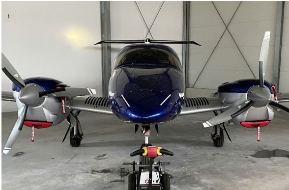
DA-62 engine inlet plugs

Engine Inlet Plugs are custom fit for your Diamond DA-62 intakes, made with heavy-duty vinyl material, and stuffed with a single block of sculpted urethane foam. Each plug has a zipper that allows the foam to be removed and dried if necessary. Engine plugs have warning flags that are visible from the cockpit or 'remove before flight' streamers sewn onto the face of the plugs. Most plugs are imprinted with the aircraft registration number in black for an extra charge. Storage bag NOT included. Engine plugs may be inserted after flight when the engine is still warm. Engine Inlet Plugs are commonly referred to as Cowl Plugs, Intake Plugs, Cowl Blocks, Engine Blocks, and Engine Bungs.