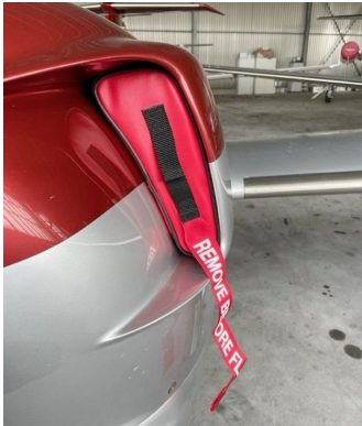
Diamond DA-62 Engine Inlet Plugs