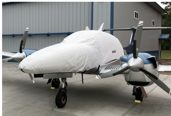
Diamond DA-62 Canopy/Nose Cover