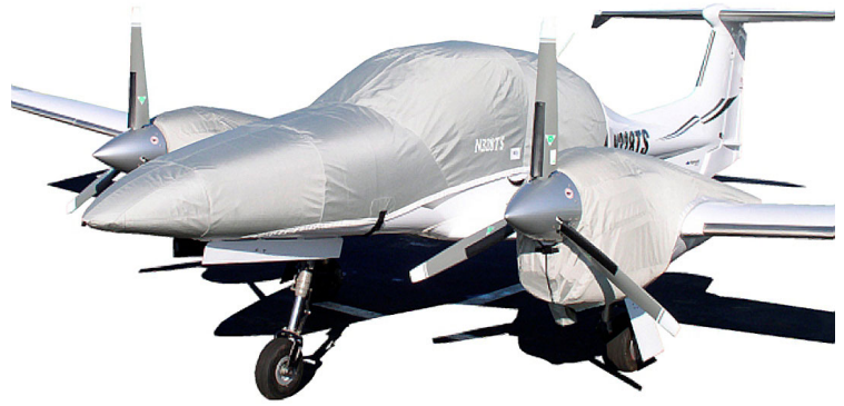
Diamond Twinstar Canopy/Nose Cover & Engine Covers