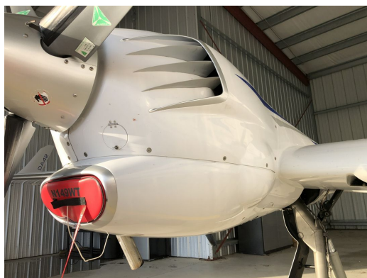
Diamond DA-42 Engine Inlet Plugs

Engine Inlet Plugs are custom fit for your Diamond DA-42 Twin Star intakes, made with heavy-duty vinyl material, and stuffed with a single block of sculpted urethane foam. Each plug has a zipper that allows the foam to be removed and dried if necessary. Engine plugs have warning flags that are visible from the cockpit or 'remove before flight' streamers sewn onto the face of the plugs. Most plugs are imprinted with the aircraft registration number in black for an extra charge. Storage bag NOT included. Engine plugs may be inserted after flight when the engine is still warm. Engine Inlet Plugs are commonly referred to as Cowl Plugs, Intake Plugs, Cowl Blocks, Engine Blocks, and Engine Bungs.