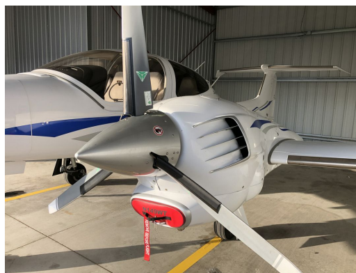
Diamond DA-42 Engine Inlet Plugs