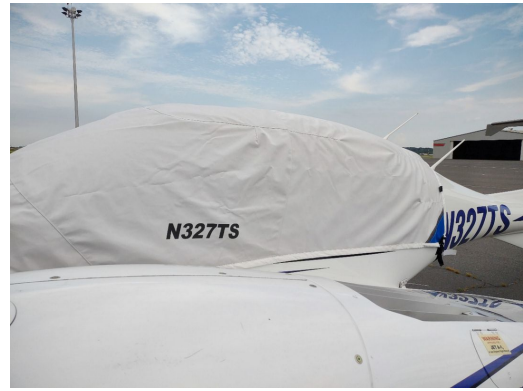
Diamone DA-42 Twin Star Canopy Cover