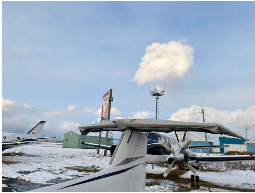
Diamond DA-42 Horizontal Stabilizer Cover

WINTER USE MATERIAL - Made with Solution-Dyed Polyester fabric, this option is intended for seasonal use to aid in deicing, rain mitigation, or for occasional travel. The material is lighter and more compact, but more susceptible to UV damage and may have a shorter useful life if used continuously outside than the all-year use material.