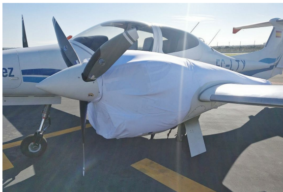
DA42 MPP Guardian (DA42-NG) Engine Cover, test fit cover