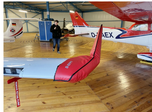
Diamond DA-40 Wingtip Pads