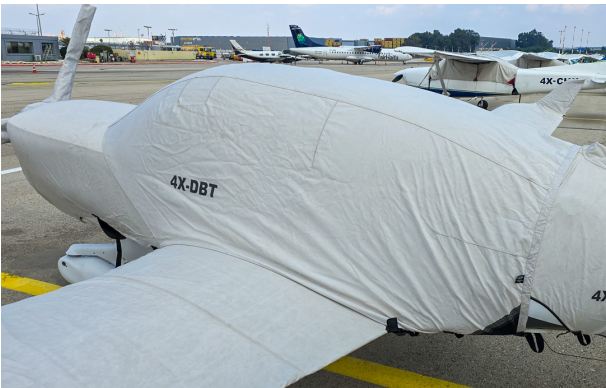
Diamond DA-40 Extended Canopy/Engine Cover, Ng Model (Aft Scoop Ext.)