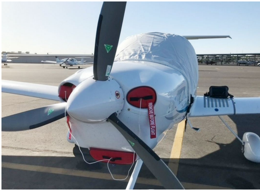
Diamond DA-40 NG Engine Plugs