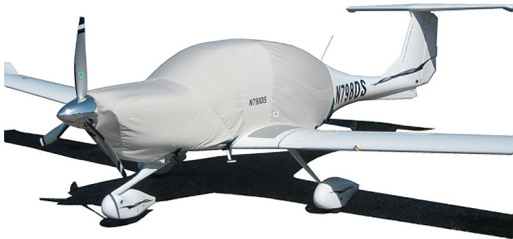
Diamond DA-40 Extended Canopy/Engine Cover

This cover type is made from Silver Acrylic Sunbrella canvas and is 100% lined with a soft and smooth microfiber. Bruce's Custom Covers developed this material combination especially for aircraft protection. The outer material is medium weight and treated for water resistance, UV resistance and anti-static buildup. The inner lining is a very soft and smooth microfiber to prevent scratching. The material is very reflective, and tests show that the cabin interior temperature can be reduced to near-ambient temperature on the hottest of days. It is water, ice and snow repellent, yet breathable to allow moisture to escape from between the cover and the aircraft surface.