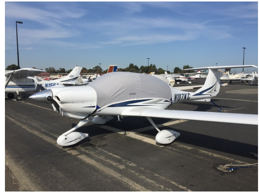
Diamond DA-40 Travel Cover, Light Weight Travel Canopy Cover