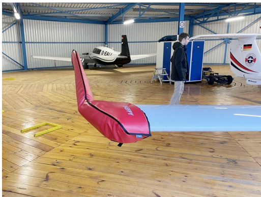
Diamond DA-40 Wingtip Pads

Designed to prevent damage to the aircraft extremities in crowded hangars, these products are made of bright red Naugahyde and thickly padded with a sandwich of closed cell foam.