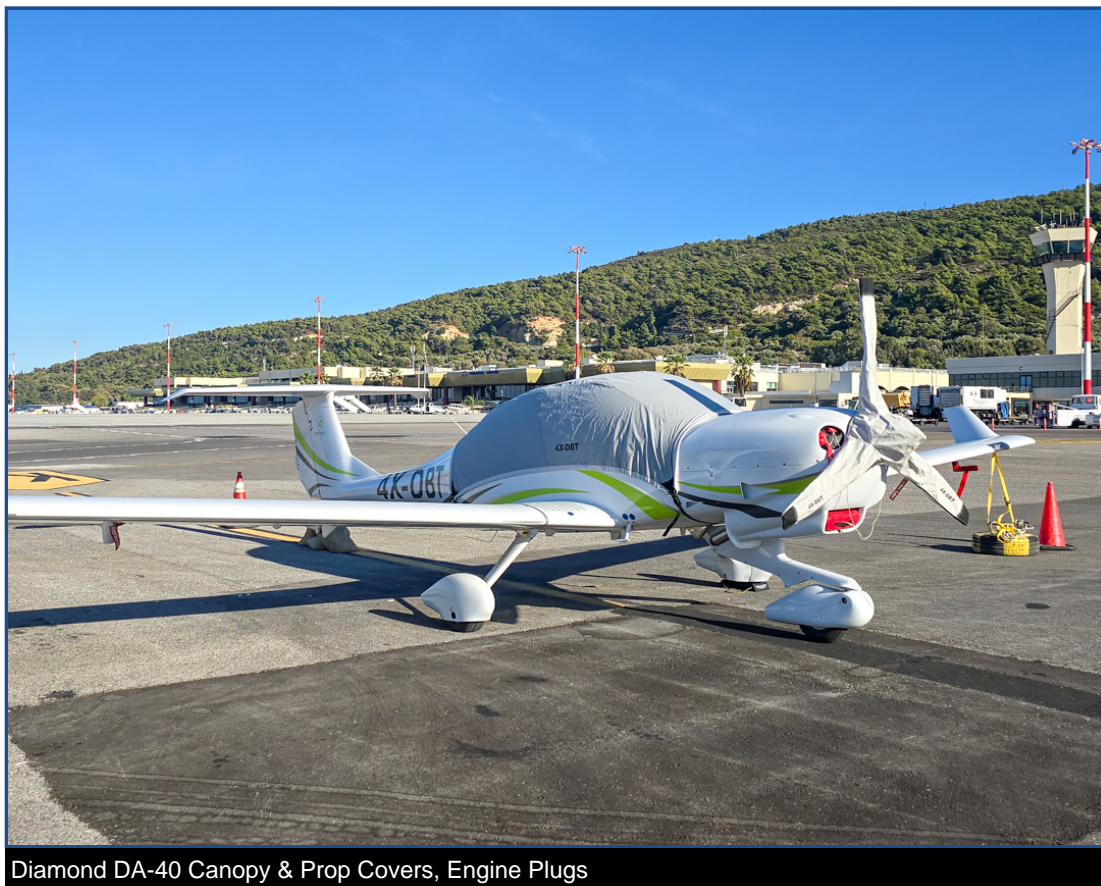
Diamond DA-40 Canopy &amp; Prop Covers, Engine Plugs