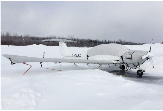
Diamond DA40 Canopy, Insulated Engine, Wing and Stab. Covers