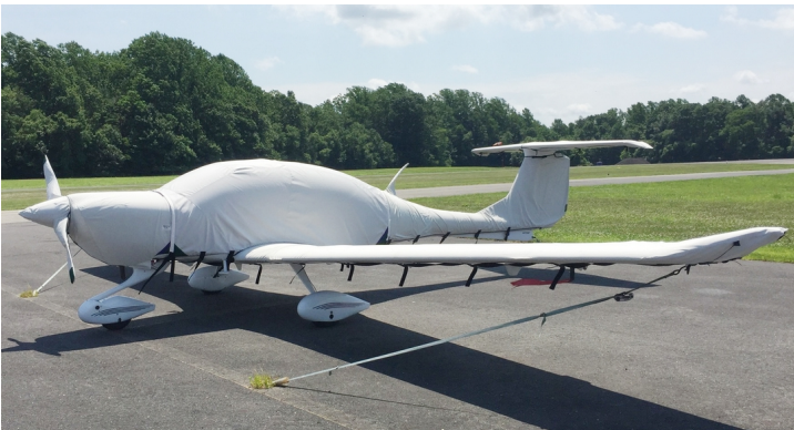
Diamond DA-40 Extended Canopy, Wing, Engine, Prop, Empennage & Horiz. Stab Covers

WINTER USE MATERIAL - Made with Solution-Dyed Polyester fabric, this option is intended for seasonal use to aid in deicing, rain mitigation, or for occasional travel. The material is lighter and more compact, but more susceptible to UV damage and may have a shorter useful life if used continuously outside than the all-year use material.