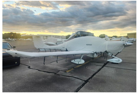
Diamond DA-40 Winter Cover Set