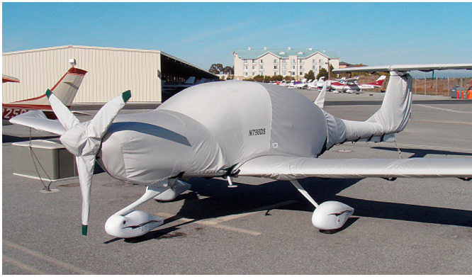
Diamond DA-40 Full Cover Set