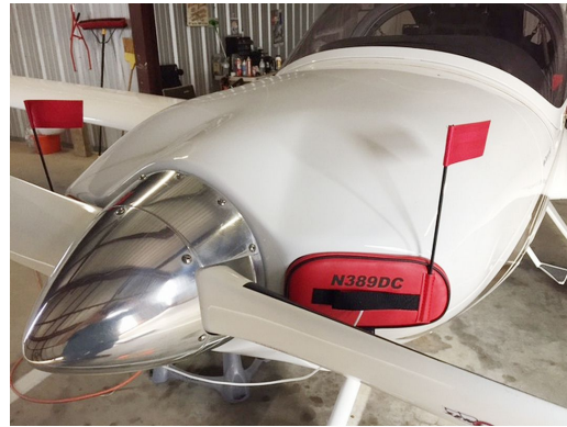
Diamond DA-20-C1 Engine Inlet Plugs