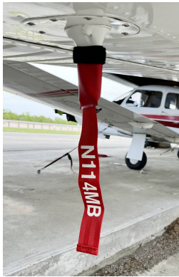
Blade-type Pitot Cover

Engine Inlet Plugs are custom fit for your Diamond DA-20, Katana, Eclipse intakes, made with heavy-duty vinyl material, and stuffed with a single block of sculpted urethane foam. Each plug has a zipper that allows the foam to be removed and dried if necessary. Engine plugs have warning flags that are visible from the cockpit or 'remove before flight' streamers sewn onto the face of the plugs. Most plugs are imprinted with the aircraft registration number in black for an extra charge. Storage bag NOT included. Engine plugs may be inserted after flight when the engine is still warm. Engine Inlet Plugs are commonly referred to as Cowl Plugs, Intake Plugs, Cowl Blocks, Engine Blocks, and Engine Bungs.