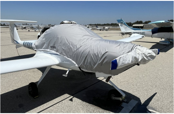
Diamond DA-20 Canopy/Engine Cover (Travel Weight), Prop Cover