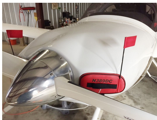
Diamond DA-20-C1 Engine Inlet Plugs