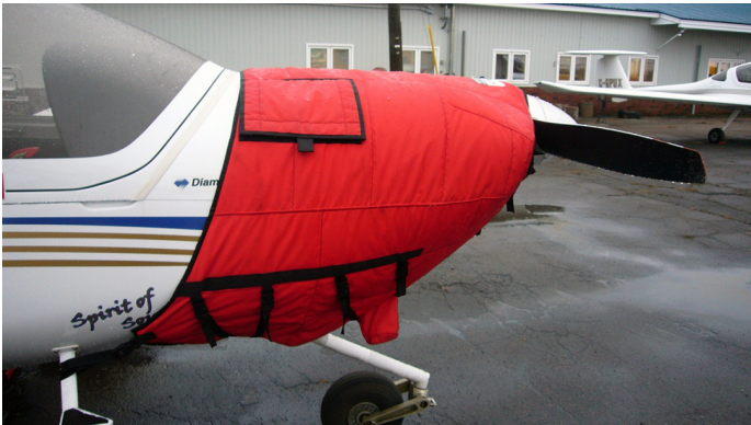
Diamond DA-20-C1 Insulated Engine Cover