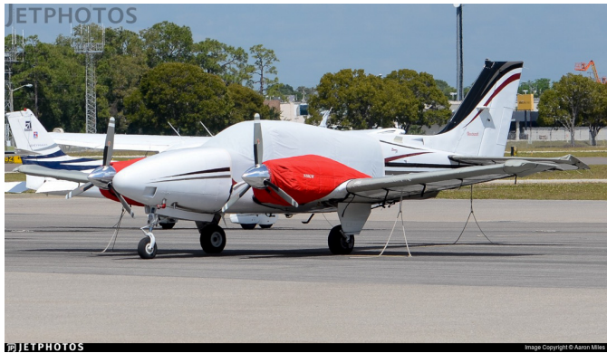
Beech Baron 58, G58 Canopy Cover, Insulated Engine Covers

The material is very reflective, and tests show that the cabin interior temperature can be reduced to near-ambient temperature on the hottest of days. It is water, ice and snow repellent, yet breathable to allow moisture to escape from between the cover and the aircraft surface.