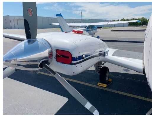
Beech Baron 58 Engine Plugs