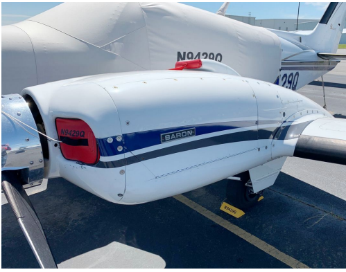
Beech Baron 58 Engine Plugs