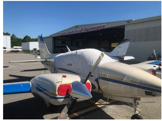
Beech Baron 95-B55 Canopy cover