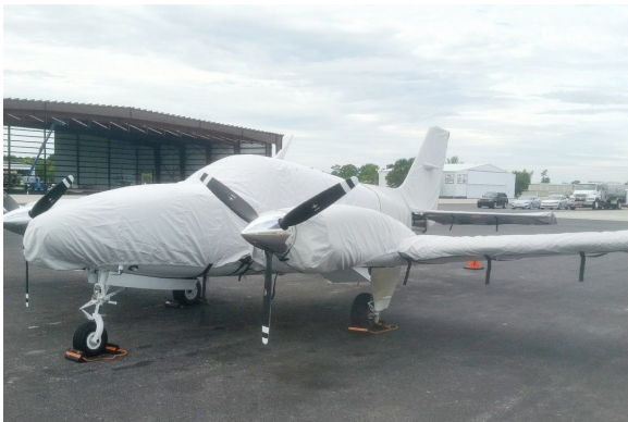
Full Cover Set (58P-020, 58P-225, 58P-405)