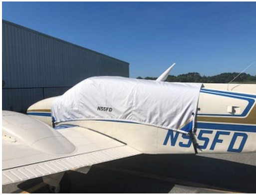
Beech Baron 95-B55 Canopy cover