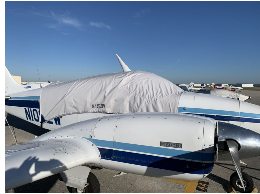
Beech Baron Canopy Cover