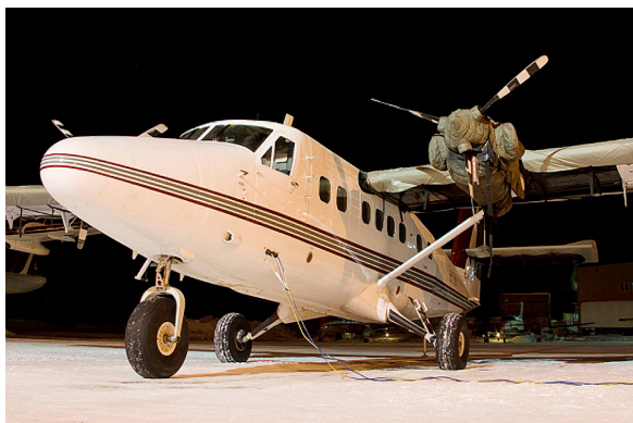
Twin Otter Wing, Horiz. Stab & Engine Covers

Engine Covers will cinch around or behind the spinner, cover the entire engine cowl area including the engine air cooling and induction air inlets, and fastens together with Velcro beneath the spinner down the front of the cowling. The Engine Cover is attached with a belly strap aft of the firewall, and can Velcro to the Canopy Cover. Engine Covers are normally made from Solution-Dyed Polyester or Acrylic Sunbrella . An Insulated version of the engine cover can be made with a thicker, quilted, and water-repellent material. The Insulated Engine Cover works well in cold climates to help with engine preheating.