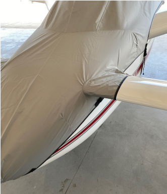
Cozy Mk IV Canopy/Nose/Engine Cover, travel weight design