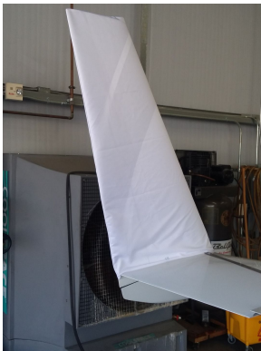
Velocity Vertical Stabilizer Covers, test fit cover

WINTER USE MATERIAL - Made with Solution-Dyed Polyester fabric, this option is intended for seasonal use to aid in deicing, rain mitigation, or for occasional travel. The material is lighter and more compact, but more susceptible to UV damage and may have a shorter useful life if used continuously outside than the all-year use material.