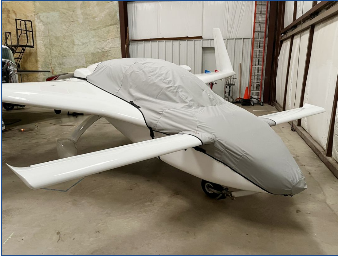
Cozy Mk IV Canopy/Nose Cover, travel weight