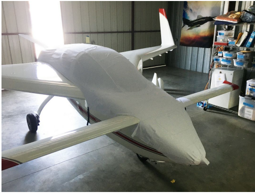
Cozy Canopy/Nose/Engine Cover, test fit cover

water resistance, UV resistance and anti-static buildup. The inner lining is a very soft and smooth microfiber to prevent scratching. The material is very reflective, and tests show that the cabin interior temperature can be reduced to near-ambient temperature on the hottest of days. It is water, ice and snow repellent, yet breathable to allow moisture to escape from between the cover and the aircraft surface.