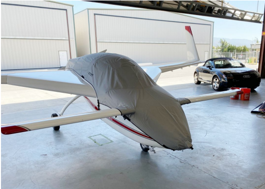
Cozy Mk IV Canopy/Nose/Engine Cover, travel weight design

Travel Covers are made with Silver Solution-Dyed Polyester fabric and only lined over the windshield to save weight. The material is lightweight and more compact for easy stowage in the aircraft. The polyester material is water resistant, but only intended for occasional use outside. We also have an ultra lightweight material available for fitted hangar dust covers. For daily outdoor use, the non-travel Sunbrella Cover is the best choice.