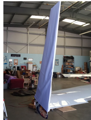
Velocity Vertical Stabilizer Covers, test fit cover