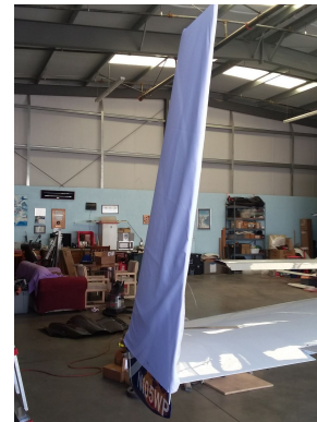
Velocity Vertical Stabilizer Covers, test fit cover