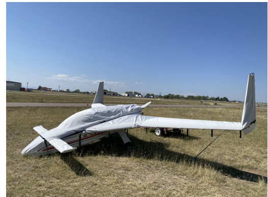
Cozy Mk IV Complete Cover Set