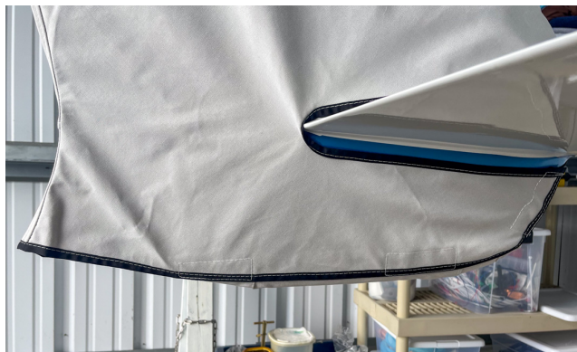
Cozy All Models Vertical Stabilizer Covers, All Year Use