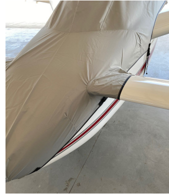
Cozy Mk IV Canopy/Nose/Engine Cover, travel weight design