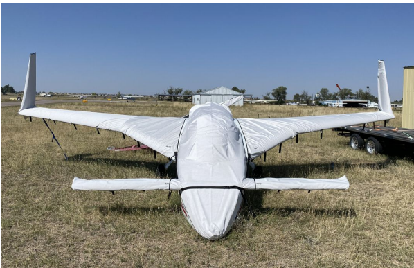
Cozy Mk IV Complete Cover Set

WINTER USE MATERIAL - Made with Solution-Dyed Polyester fabric, this option is intended for seasonal use to aid in deicing, rain mitigation, or for occasional travel. The material is lighter and more compact, but more susceptible to UV damage and may have a shorter useful life if used continuously outside than the all-year use material.