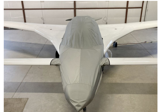
Cozy Mk IV Canopy/Nose/Engine Cover, travel weight design