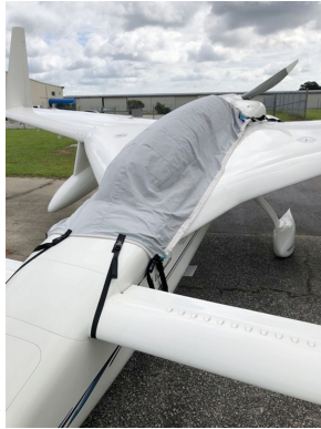
Cozy All Models Travel Cover, Light Weight Canopy Cover, Mark Iv Models

Travel Covers are made with Silver Solution-Dyed Polyester fabric and only lined over the windshield to save weight. The material is lightweight and more compact for easy stowage in the aircraft. The polyester material is water resistant, but only intended for occasional use outside. We also have an ultra lightweight material available for fitted hangar dust covers. For daily outdoor use, the non-travel Sunbrella Cover is the best choice.