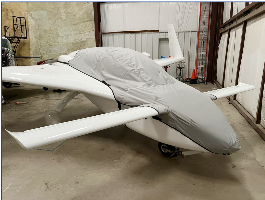
Cozy Mk IV Canopy/Nose Cover, travel weight