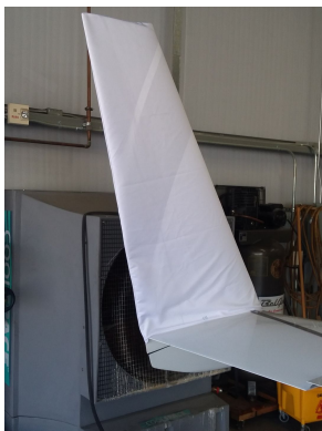
Velocity Vertical Stabilizer Covers, test fit cover

WINTER USE MATERIAL - Made with Solution-Dyed Polyester fabric, this option is intended for seasonal use to aid in deicing, rain mitigation, or for occasional travel. The material is lighter and more compact, but more susceptible to UV damage and may have a shorter useful life if used continuously outside than the all-year use material.