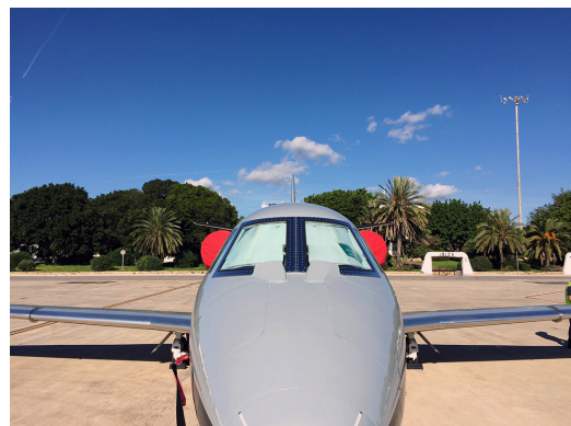
Cessna Citation XL, XLS (560XL) Cockpit Heatshields