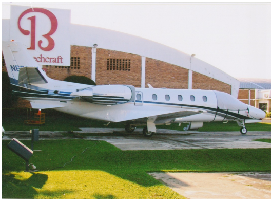
Citation XL Cockpit Cover & Bikini Type Engine Cover