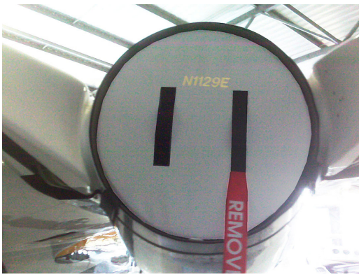
Citation XLS Exhaust Plugs