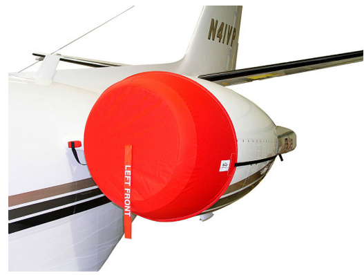
Citation Encore Intake Cover Set