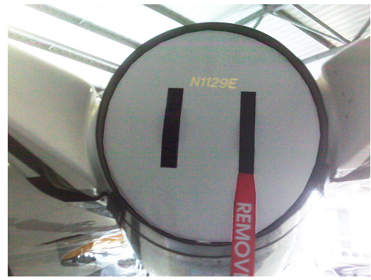
Citation XLS Exhaust Plugs