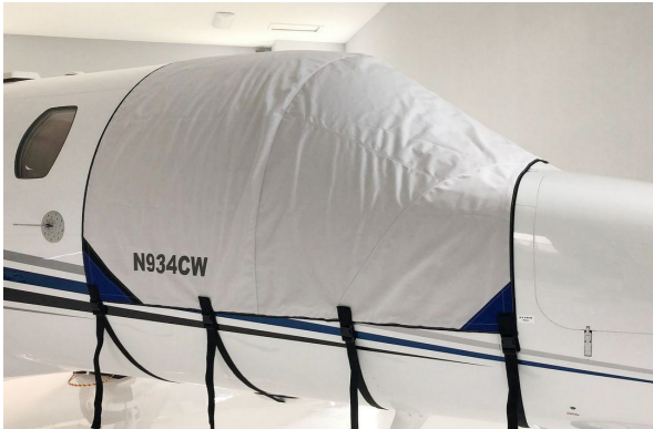
Cessna Citation M2 Cockpit Cover

This cover type is made from Silver Acrylic Sunbrella canvas and is 100% lined with a soft and smooth microfiber. Bruce's Custom Covers developed this material combination especially for aircraft protection. The outer material is medium weight and treated for water resistance, UV resistance and anti-static buildup. The inner lining is a very soft and smooth microfiber to prevent scratching. The material is very reflective, and tests show that the cabin interior temperature can be reduced to near-ambient temperature on the hottest of days. It is water, ice and snow repellent, yet breathable to allow moisture to escape from between the cover and the aircraft surface.