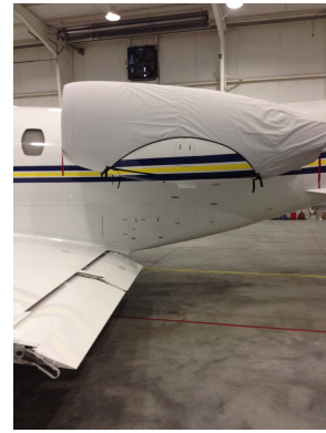
Cessna Citation 560XL Upper Nacelle/Brightwork Covers