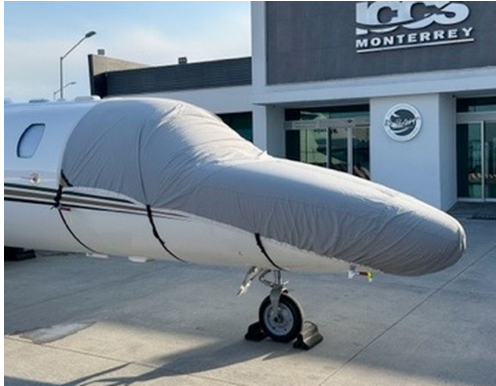
Cessna Citationjet 525B Travel Weight Cockpit/Nose Cover

This cover type is made from Silver Acrylic Sunbrella canvas and is 100% lined with a soft and smooth microfiber. Bruce's Custom Covers developed this material combination especially for aircraft protection. The outer material is medium weight and treated for water resistance, UV resistance and anti-static buildup. The inner lining is a very soft and smooth microfiber to prevent scratching. The material is very reflective, and tests show that the cabin interior temperature can be reduced to near-ambient temperature on the hottest of days. It is water, ice and snow repellent, yet breathable to allow moisture to escape from between the cover and the aircraft surface.