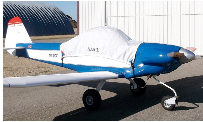
Thatcher CX-4 Canopy Cover