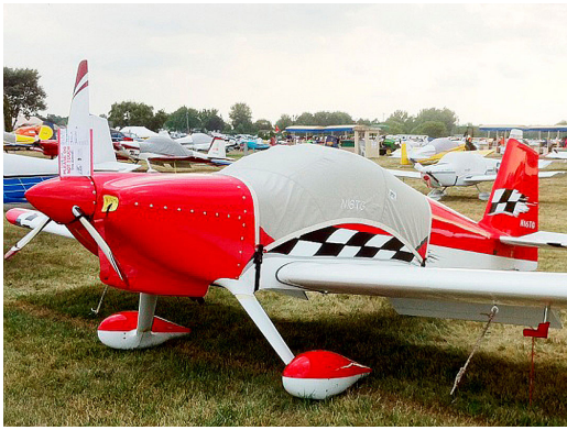
Van's RV-6 Canopy Cover