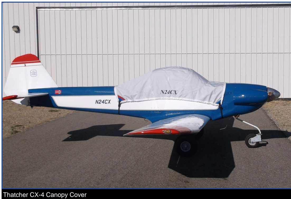
Thatcher CX-4 Canopy Cover