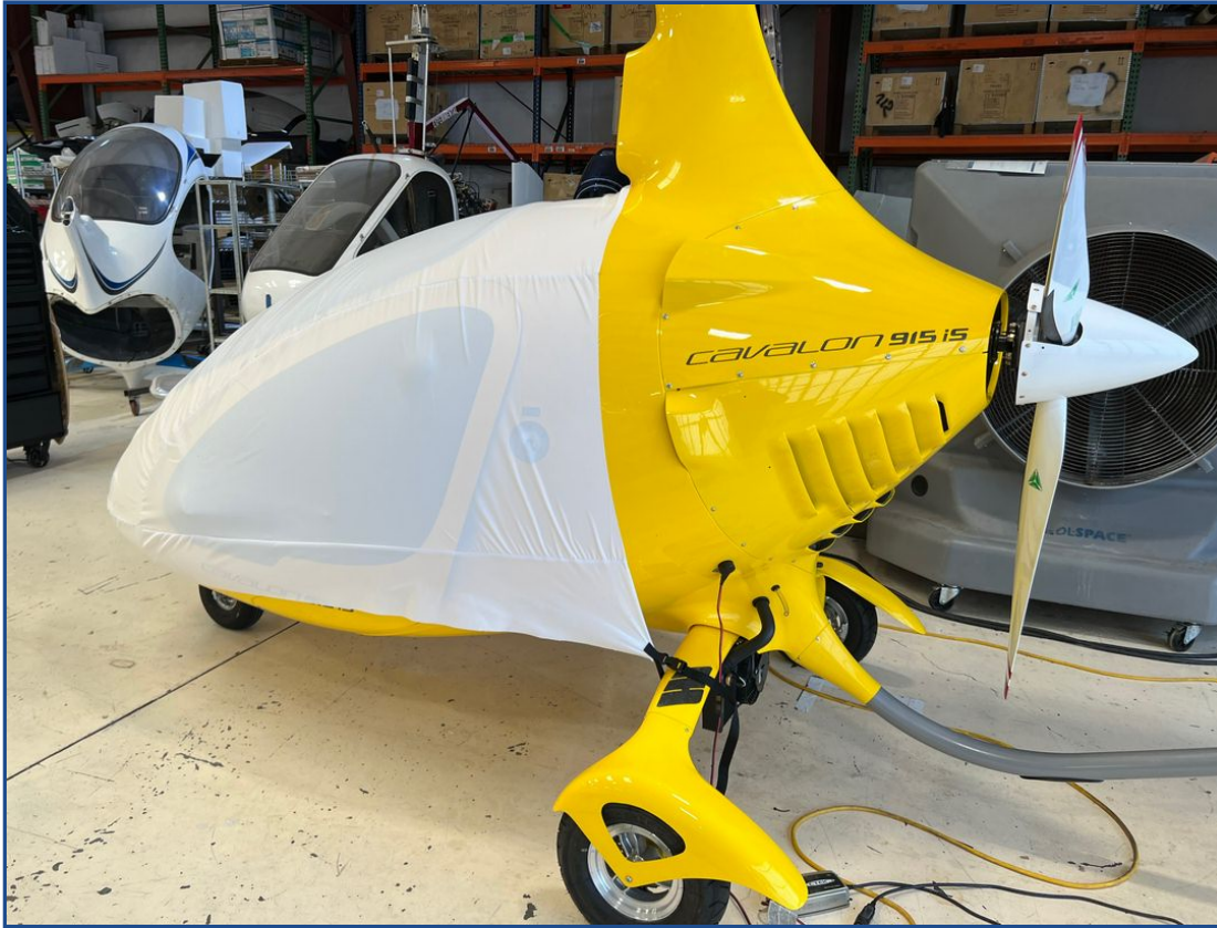
Autogyro Cavalon Canopy/Nose Cover, test fit cover