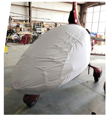
Cavalon Gyrocopter Bubble Cover, test fit cover