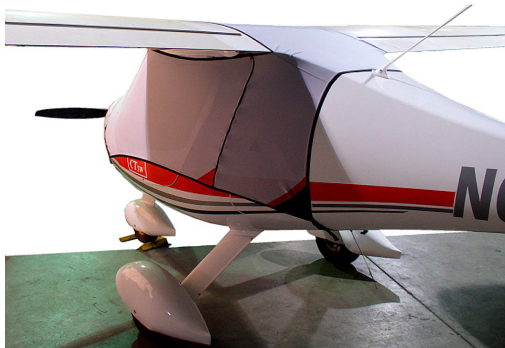
Flight Design CTSW Spandex FlyAway Travel Cover

Travel Covers are made with Silver Solution-Dyed Polyester fabric and only lined over the windshield to save weight. The material is lightweight and more compact for easy stowage in the aircraft. The polyester material is water resistant, but only intended for occasional use outside. We also have an ultra lightweight material available for fitted hangar dust covers. For daily outdoor use, the non-travel Sunbrella Cover is the best choice.