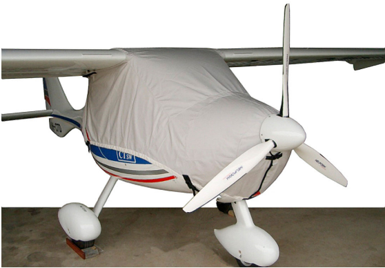
Flight Design CTSW Canopy/Engine Cover

This cover type is made from Silver Acrylic Sunbrella canvas and is 100% lined with a soft and smooth microfiber. Bruce's Custom Covers developed this material combination especially for aircraft protection. The outer material is medium weight and treated for water resistance, UV resistance and anti-static buildup. The inner lining is a very soft and smooth microfiber to prevent scratching. The material is very reflective, and tests show that the cabin interior temperature can be reduced to near-ambient temperature on the hottest of days. It is water, ice and snow repellent, yet breathable to allow moisture to escape from between the cover and the aircraft surface.