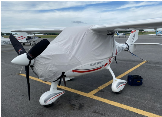
Flight Design CTSW Canopy/Engine Cover

This cover type is made from Silver Acrylic Sunbrella canvas and is 100% lined with a soft and smooth microfiber. Bruce's Custom Covers developed this material combination especially for aircraft protection. The outer material is medium weight and treated for water resistance, UV resistance and anti-static buildup. The inner lining is a very soft and smooth microfiber to prevent scratching. The material is very reflective, and tests show that the cabin interior temperature can be reduced to near-ambient temperature on the hottest of days. It is water, ice and snow repellent, yet breathable to allow moisture to escape from between the cover and the aircraft surface.