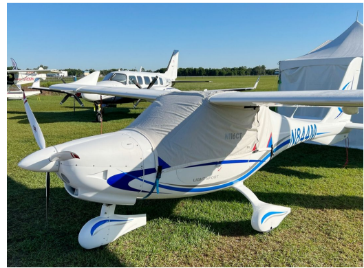
Flight Design F2-LSA Canopy Cover