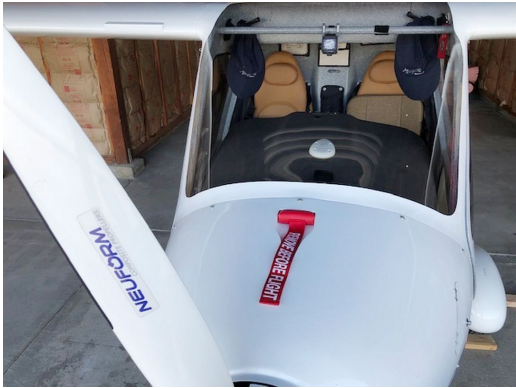
Flight Design CTSW, CTLS, 2K & MC Engine Inlet Plugs

Engine Inlet Plugs are custom fit for your Flight Design CTSW, CTLS, 2K, MC & F2 intakes, made with heavy-duty vinyl material, and stuffed with a single block of sculpted urethane foam. Each plug has a zipper that allows the foam to be removed and dried if necessary. Engine plugs have warning flags that are visible from the cockpit or 'remove before flight' streamers sewn onto the face of the plugs. Most plugs are imprinted with the aircraft registration number in black for an extra charge. Storage bag NOT included. Engine plugs may be inserted after flight when the engine is still warm. Engine Inlet Plugs are commonly referred to as Cowl Plugs, Intake Plugs, Cowl Blocks, Engine Blocks, and Engine Bungs.