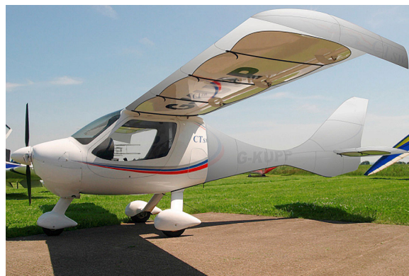
Wing Covers & Empennage Cover (illustration)