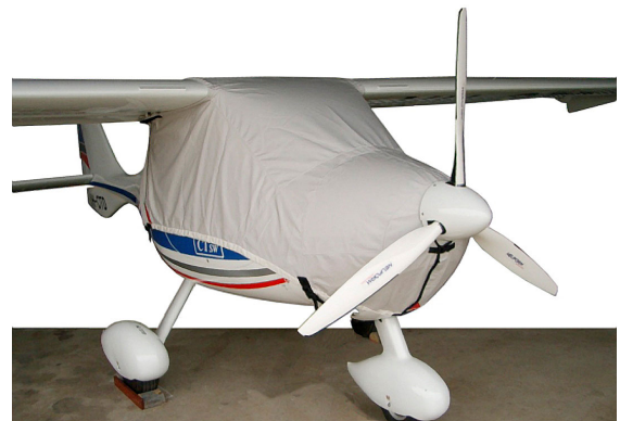
Flight Design CTSW Canopy/Engine Cover