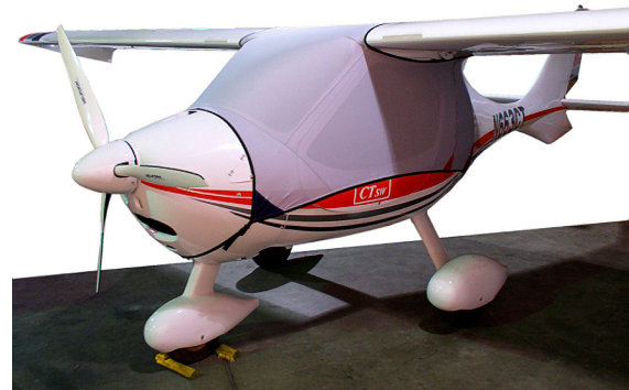
Flight Design CTSW Spandex FlyAway Travel Cover