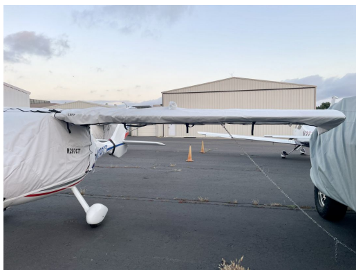
Flight Design CTSW Wing Covers

WINTER USE MATERIAL - Made with Solution-Dyed Polyester fabric, this option is intended for seasonal use to aid in deicing, rain mitigation, or for occasional travel. The material is lighter and more compact, but more susceptible to UV damage and may have a shorter useful life if used continuously outside than the all-year use material.