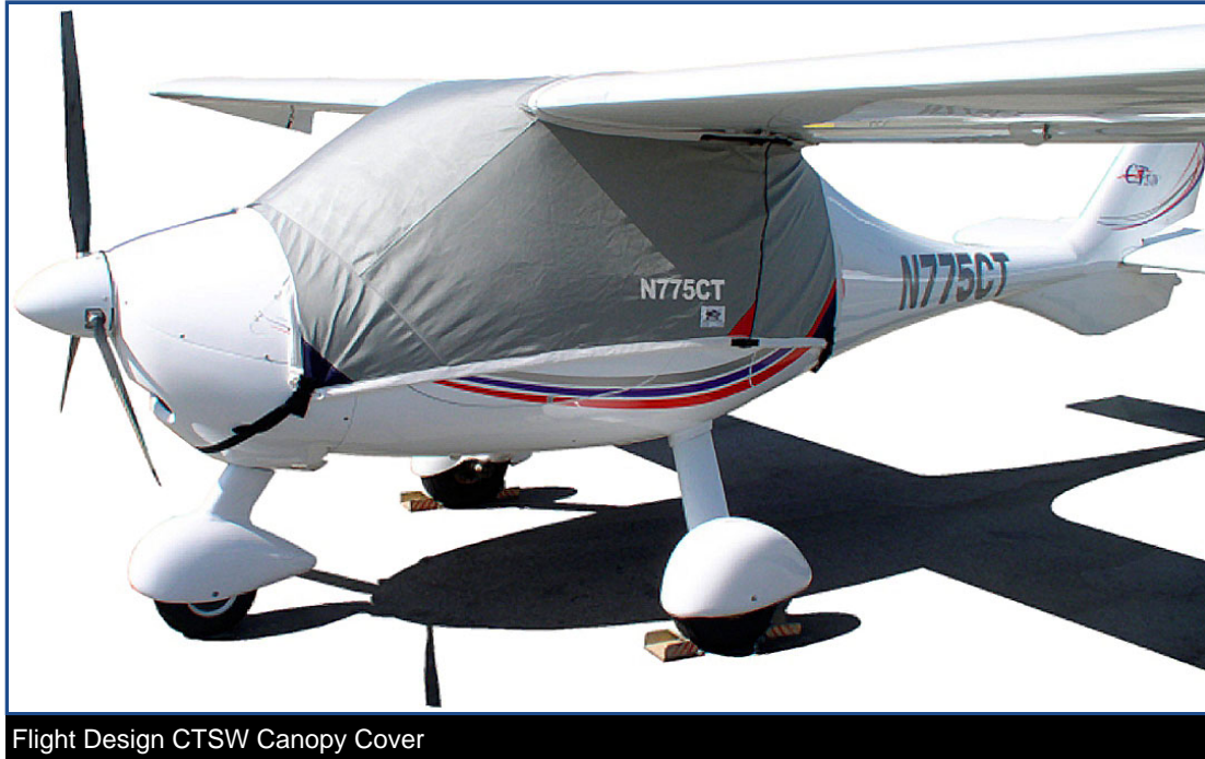
Flight Design CTSW Canopy Cover