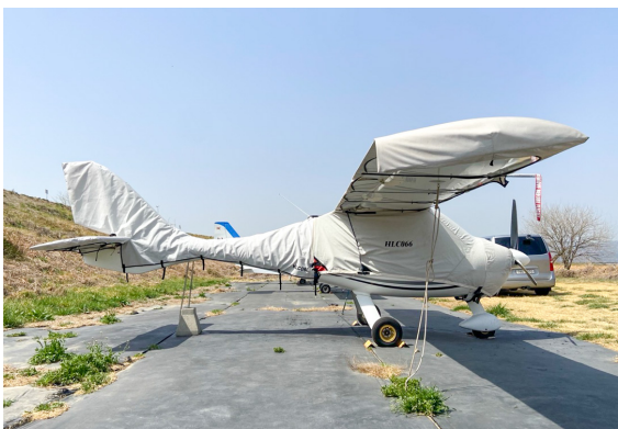
Flight Design CTSW, CTLS, 2K, MC & F2 Empennage Cover (Tailboom, Vertical & Horiz Stabilizers), Ctsw Model, All Year Use