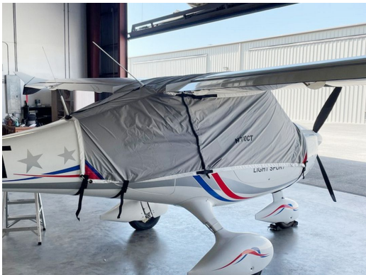
Flight Design CTLS Travel Cover

Travel Covers are made with Silver Solution-Dyed Polyester fabric and only lined over the windshield to save weight. The material is lightweight and more compact for easy stowage in the aircraft. The polyester material is water resistant, but only intended for occasional use outside. We also have an ultra lightweight material available for fitted hangar dust covers. For daily outdoor use, the non-travel Sunbrella Cover is the best choice.