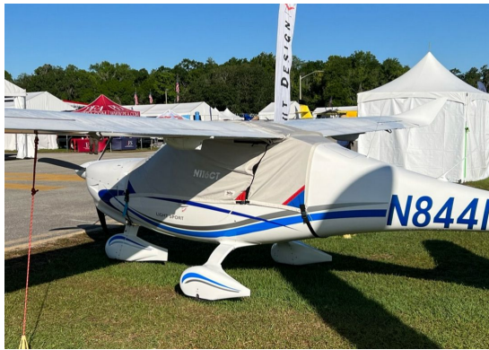
Flight Design F2-LSA Canopy Cover

This cover type is made from Silver Acrylic Sunbrella canvas and is 100% lined with a soft and smooth microfiber. Bruce's Custom Covers developed this material combination especially for aircraft protection. The outer material is medium weight and treated for water resistance, UV resistance and anti-static buildup. The inner lining is a very soft and smooth microfiber to prevent scratching. The material is very reflective, and tests show that the cabin interior temperature can be reduced to near-ambient temperature on the hottest of days. It is water, ice and snow repellent, yet breathable to allow moisture to escape from between the cover and the aircraft surface.