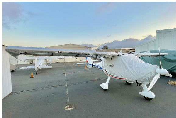
Flight Design CTSW Extended Canopy/Engine & Wing Covers