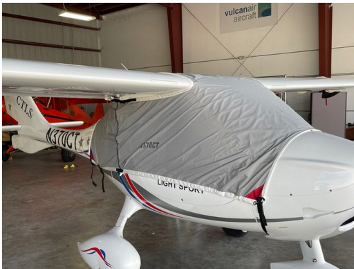
Flight Design CTSLS Travel Cover

Travel Covers are made with Silver Solution-Dyed Polyester fabric and only lined over the windshield to save weight. The material is lightweight and more compact for easy stowage in the aircraft. The polyester material is water resistant, but only intended for occasional use outside. We also have an ultra lightweight material available for fitted hangar dust covers. For daily outdoor use, the non-travel Sunbrella Cover is the best choice.