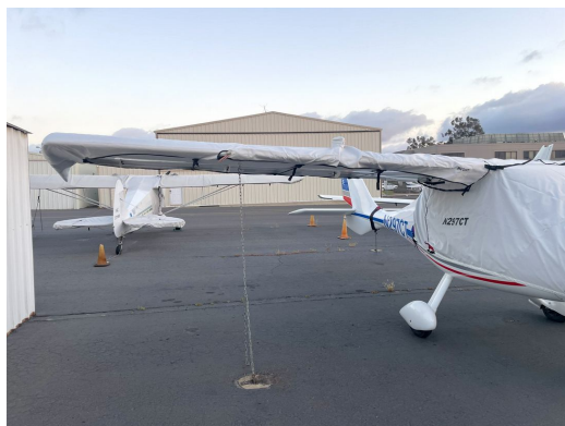
Flight Design CTSW Wing Covers

WINTER USE MATERIAL - Made with Solution-Dyed Polyester fabric, this option is intended for seasonal use to aid in deicing, rain mitigation, or for occasional travel. The material is lighter and more compact, but more susceptible to UV damage and may have a shorter useful life if used continuously outside than the all-year use material.