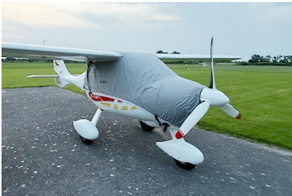
Flight Design CTSW Canopy/Engine Cover, Travel Weight Design