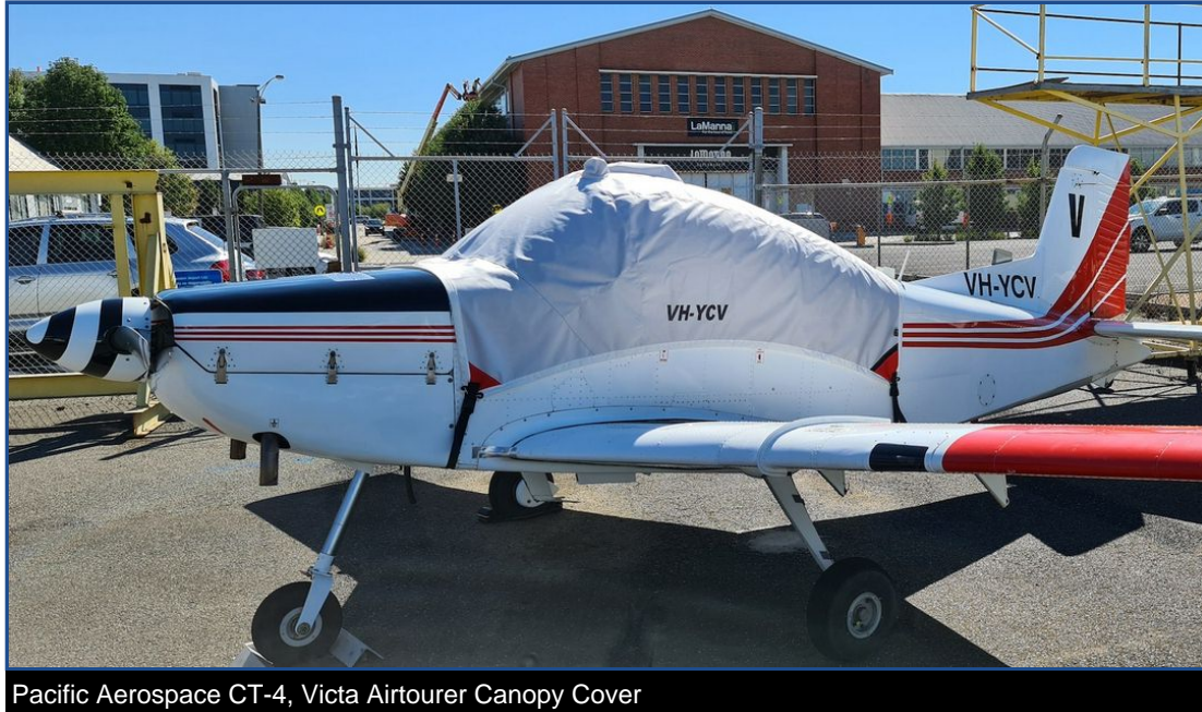
Pacific Aerospace CT-4, Victa Airtourer Canopy Cover