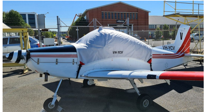
Pacific Aerospace CT-4, Victa Airtourer Canopy Cover