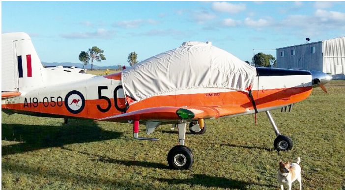
Pacific Aerospace CT-4 Canopy Cover

This cover type is made from Silver Acrylic Sunbrella canvas and is 100% lined with a soft and smooth microfiber. Bruce's Custom Covers developed this material combination especially for aircraft protection. The outer material is medium weight and treated for water resistance, UV resistance and anti-static buildup. The inner lining is a very soft and smooth microfiber to prevent scratching. The material is very reflective, and tests show that the cabin interior temperature can be reduced to near-ambient temperature on the hottest of days. It is water, ice and snow repellent, yet breathable to allow moisture to escape from between the cover and the aircraft surface.