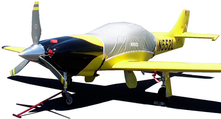
Canopy Cover for Lancair Legacy

The material is very reflective, and tests show that the cabin interior temperature can be reduced to near-ambient temperature on the hottest of days. It is water, ice and snow repellent, yet breathable to allow moisture to escape from between the cover and the aircraft surface.