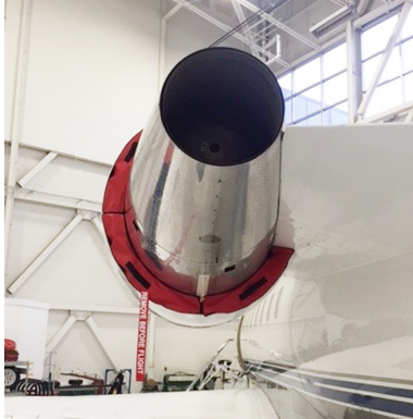
Canadair Challenger 604 Bypass Plugs

The Engine Inlet Plugs are custom fit for your Canadair Regional Jet 200, 700 intakes, made with heavy-duty vinyl material, and stuffed with a single block of sculpted urethane foam. Each plug has a zipper that allows the foam to be removed and dried if necessary. Engine plugs have 'remove before flight' streamers sewn onto the face of the plugs. Most plugs are imprinted with the aircraft registration number in black for an extra charge. Storage bag NOT included. Engine plugs may be inserted after flight when the engine is still warm. Engine Inlet Plugs are commonly referred to as Cowl Plugs, Intake Plugs, Cowl Blocks, Engine Blocks, and Engine Bungs.