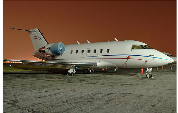
Challenger 601 Intake Covers, standard design