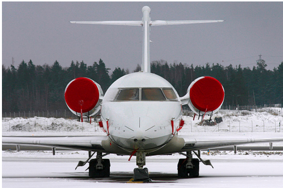
Challenger 604 Intake Covers, OEM design