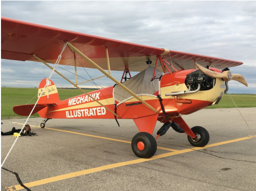
Corben Baby Ace Cockpit Cover