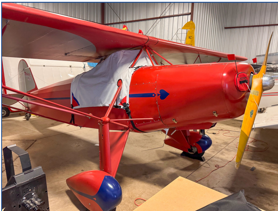
Corben Baby Ace, Junior Ace, and similar models Cockpit Cover