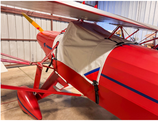
Corben Baby Ace, Junior Ace, and similar models Cockpit Cover