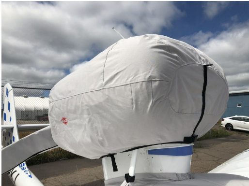
Coot Engine Cover

This cover type is made from Silver Acrylic Sunbrella canvas and is 100% lined with a soft and smooth microfiber. Bruce's Custom Covers developed this material combination especially for aircraft protection. The outer material is medium weight and treated for water resistance, UV resistance and anti-static buildup. The inner lining is a very soft and smooth microfiber to prevent scratching. The material is very reflective, and tests show that the cabin interior temperature can be reduced to near-ambient temperature on the hottest of days. It is water, ice and snow repellent, yet breathable to allow moisture to escape from between the cover and the aircraft surface.