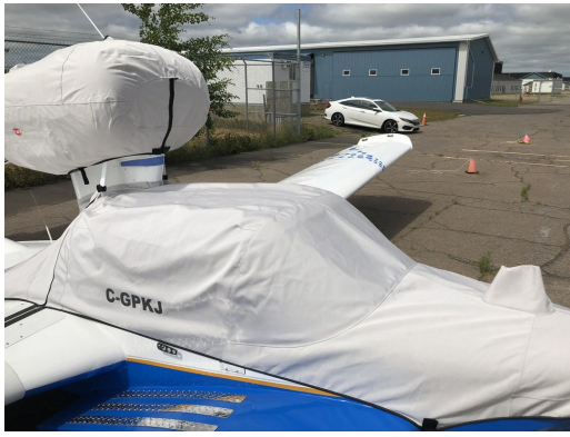
Coot Canopy/Nose, Engine & Prop Covers