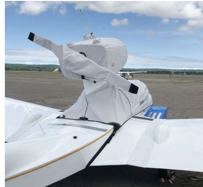
Taylor Coot Canopy/Nose, Engine & Prop Cover