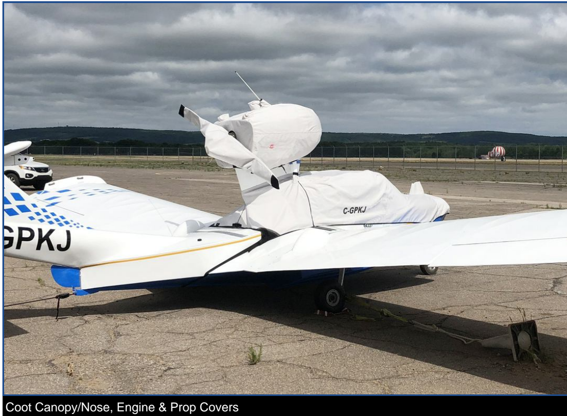
Coot Canopy/Nose, Engine &amp; Prop Covers