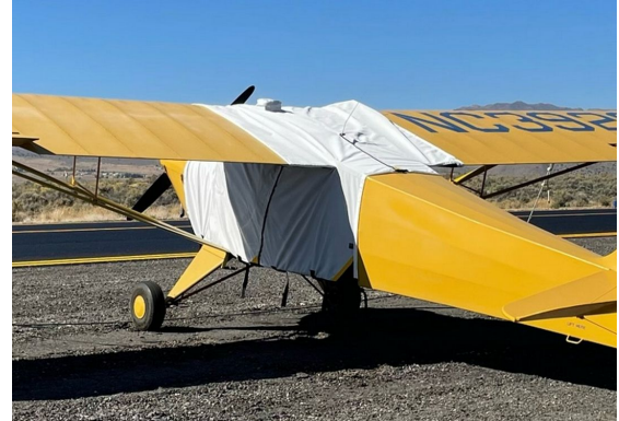
Taylorcraft BC-12D Extended Canopy Cover