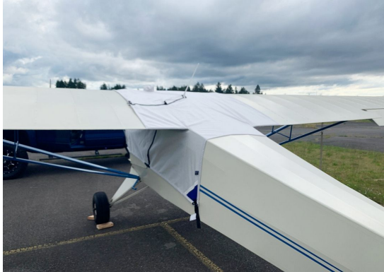
Taylorcraft Models F19 Over-The-Top Canopy Cover

This cover type is made from Silver Acrylic Sunbrella canvas and is 100% lined with a soft and smooth microfiber. Bruce's Custom Covers developed this material combination especially for aircraft protection. The outer material is medium weight and treated for water resistance, UV resistance and anti-static buildup. The inner lining is a very soft and smooth microfiber to prevent scratching. The material is very reflective, and tests show that the cabin interior temperature can be reduced to near-ambient temperature on the hottest of days. It is water, ice and snow repellent, yet breathable to allow moisture to escape from between the cover and the aircraft surface.