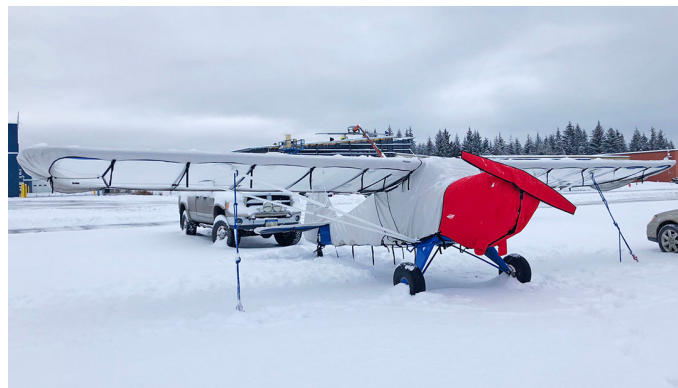
Taylorcraft Aviation Corp F19 Insulated Engine Cover