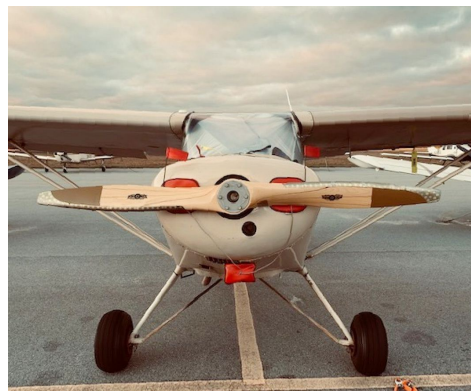
Taylorcraft Engine Inlet Plugs