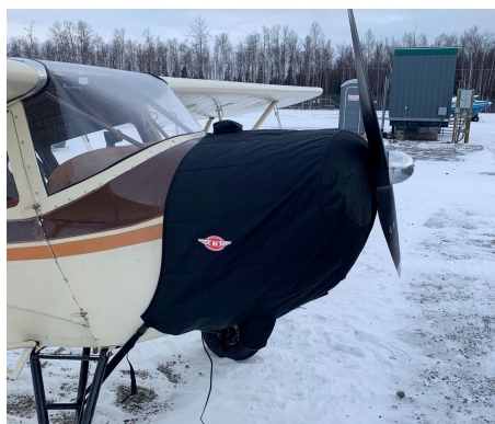
Taylorcraft Insulated Engine Cover

This cover type is made from Silver Acrylic Sunbrella canvas and is 100% lined with a soft and smooth microfiber. Bruce's Custom Covers developed this material combination especially for aircraft protection. The outer material is medium weight and treated for water resistance, UV resistance and anti-static buildup. The inner lining is a very soft and smooth microfiber to prevent scratching. The material is very reflective, and tests show that the cabin interior temperature can be reduced to near-ambient temperature on the hottest of days. It is water, ice and snow repellent, yet breathable to allow moisture to escape from between the cover and the aircraft surface.