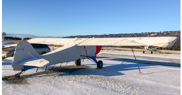
Taylorcraft Aviation Corp F19 Wing Covers