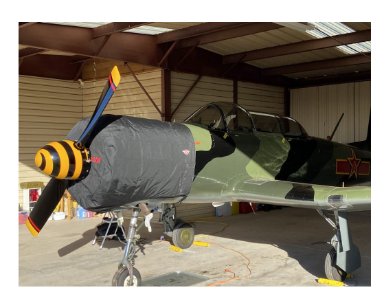
Nanchang CJ6 Insulated Engine Cover