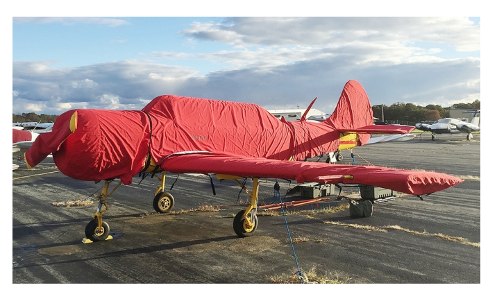
Yak 52 Full Cover Set