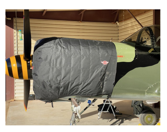
Nanchang CJ6 Insulated Engine Cover

The material is very reflective, and tests show that the cabin interior temperature can be reduced to near-ambient temperature on the hottest of days. It is water, ice and snow repellent, yet breathable to allow moisture to escape from between the cover and the aircraft surface.