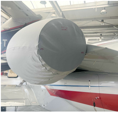
Citationjet 525C, CJ4, Complete Nacelle Cover, light weight Spandex