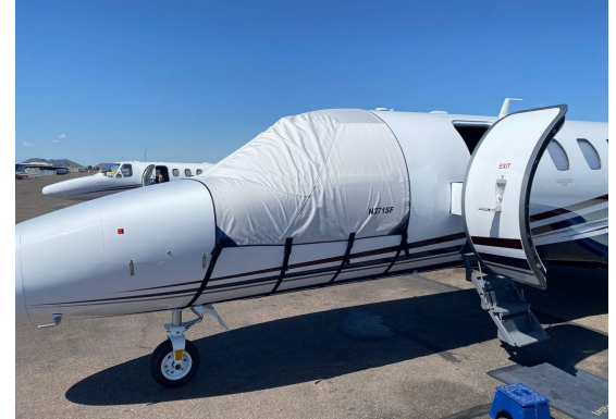
Citationjet 525C Cockpit Cover