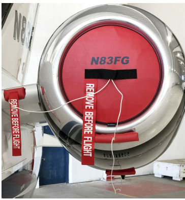
Cessna Citation Mustang 510 Engine Plugs