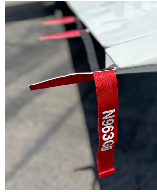
Cessna Citationjet 525C, CJ-4 Static Wick Protectors, 3 Per Wing, 1 On Tailcone Area