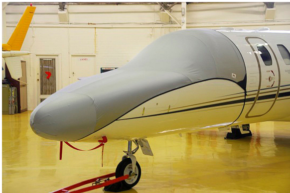
Citationjet CJ3 Cockpit/Nose Travel Cover

aircraft registration number in black for an extra charge. Storage bag NOT included. Engine plugs may be inserted after flight when the engine is still warm. Engine Inlet Plugs are commonly referred to as Cowl Plugs, Intake Plugs, Cowl Blocks, Engine Blocks, and Engine Bung.