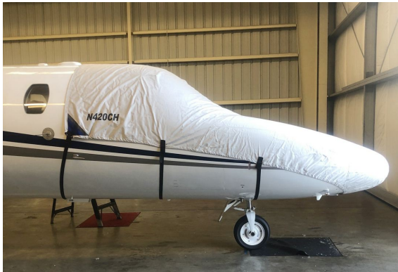
Cessna Citationjet CJ3 Cockpit/Nose Cover