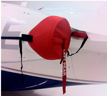
Citation CJ3 Exhaust Cover

The Cessna Citationjet 525B, CJ-3 Intake/Exhaust Plugs are custom fit for the intake and exhaust openings, made with heavy-duty vinyl material, and stuffed with a single block of sculpted urethane foam. Each plug has a zipper that allows the foam to be removed and dried if necessary. Engine plugs have 'remove before flight' streamers sewn onto the face of the plugs. Most plugs are imprinted with the aircraft registration number in black. Engine plugs may be inserted after flight when the engine is still warm. Engine Inlet Plugs are commonly referred to as Cowl Plugs, Intake Plugs, Cowl Blocks, Engine Blocks, and Engine Bungs.