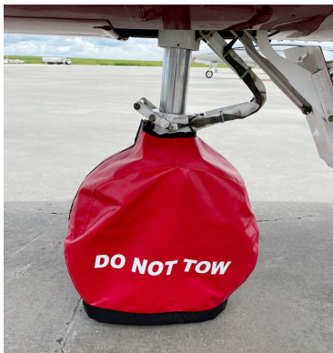
Citationjet CJ-3 Nose Gear Tire Cover

ALL-YEAR USE MATERIAL - Made with Silver Acrylic Sunbrella canvas, the all-year use material is the best option for sun protection and cover longevity. This heavier more durable material is intended for all weather conditions, such as rain and snow or lots of sun.