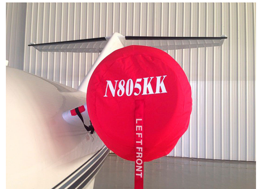
Cessna CJ1 Intake Cover and Inlet Plug