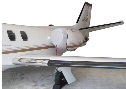
Cessna Citation "Bikini" Type Engine Covers: Extremely Light & Portable