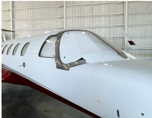
Cessna 525A Cockpit heatshields

Custom-made Heatshield Sunshades are available for almost any window in the jet. Side windows, Skylights, and Emergency Exits are all custom-made. The product is a unique composite of closed-cell foam with a silver mylar finish. The set is easily stored in the included storage sleeve. Some designs may require velcro and suction cups. Our Heatshields are offered white side out since aircraft manufacturers have issued advisories against reflective window inserts due to potential heat damage.