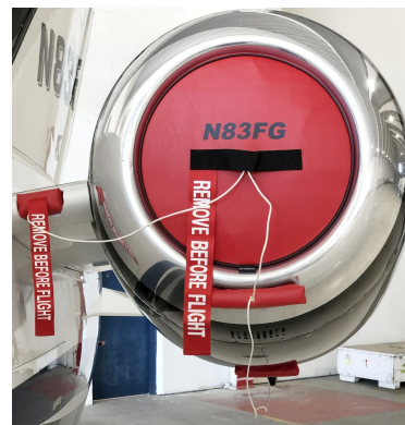
Cessna Citation Mustang 510 Engine Plugs