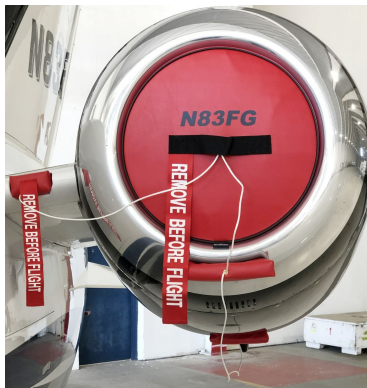
Cessna Citation Mustang 510 Engine Plugs

The Engine Inlet Plugs are custom fit for your Cessna Citationjet 525A, CJ-2, & CJ2+ intakes, made with heavy-duty vinyl material, and stuffed with a single block of sculpted urethane foam. Each plug has a zipper that allows the foam to be removed and dried if necessary. Engine plugs have 'remove before flight' streamers sewn onto the face of the plugs. Most plugs are imprinted with the aircraft registration number in black for an extra charge. Storage bag NOT included. Engine plugs may be inserted after flight when the engine is still warm. Engine Inlet Plugs are commonly referred to as Cowl Plugs, Intake Plugs, Cowl Blocks, Engine Blocks, and Engine Bunges.