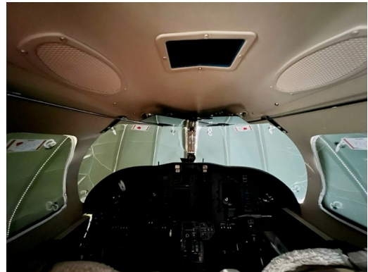
Cessna 525A Cockpit heatshields