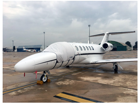
Cessna Citationjet 525A, CJ-2, & CJ2+ Cockpit Cover