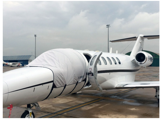
Cessna Citationjet 525A, CJ-2, & CJ2+ Cockpit Cover