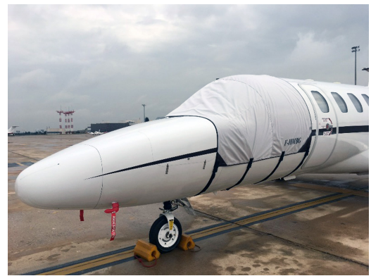
Cessna Citationjet 525A, CJ-2, & CJ2+ Cockpit Cover