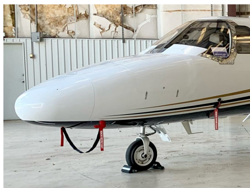
Cessna Citationjet CJ1 Pitot Cover Set

The Engine Inlet Plugs are custom fit for your Cessna Citationjet 525A, CJ-2, & CJ2+ intakes, made with heavy-duty vinyl material, and stuffed with a single block of sculpted urethane foam. Each plug has a zipper that allows the foam to be removed and dried if necessary. Engine plugs have 'remove before flight' streamers sewn onto the face of the plugs. Most plugs are imprinted with the aircraft registration number in black for an extra charge. Storage bag NOT included. Engine plugs may be inserted after flight when the engine is still warm. Engine Inlet Plugs are commonly referred to as Cowl Plugs, Intake Plugs, Cowl Blocks, Engine Blocks, and Engine Bungs.