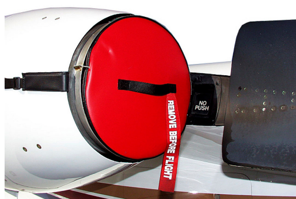
Engine Exhaust Plug