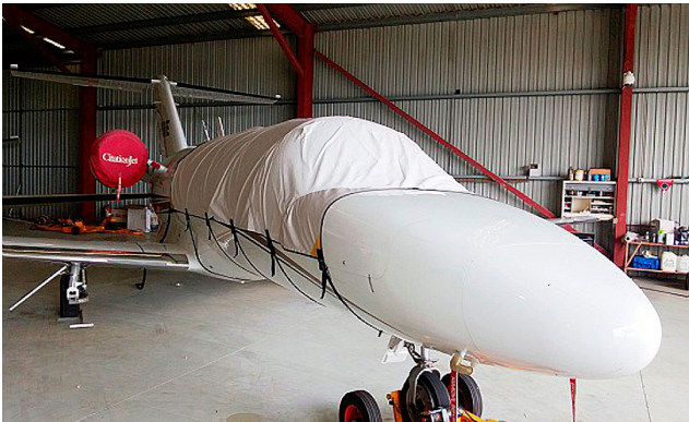
Citation CJ-1 Canopy Cover and Engine Covers

Travel Covers are made with Silver Solution-Dyed Polyester fabric and only lined over the windshield to save weight. The material is lightweight and more compact for easy stowage in the aircraft. The polyester material is water resistant, but only intended for occasional use outside. We also have an ultra lightweight material available for fitted hangar dust covers. For daily outdoor use, the non-travel Sunbrella Cover is the best choice.