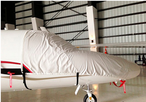
Citation CJ4 Cockpit/Nose Cover and Heat Resistant Pitot Covers set