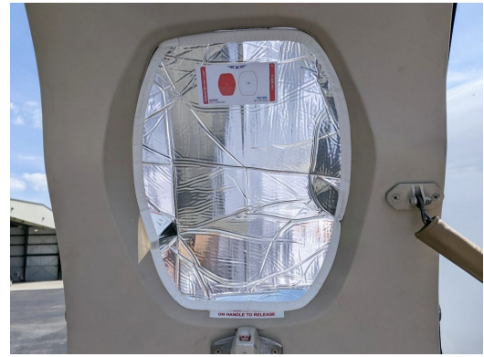
Citationjet Entrance Door Heatshield