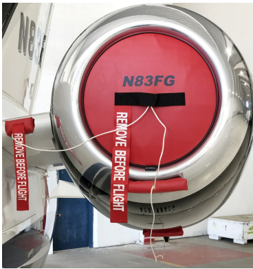
Cessna Citation Mustang 510 Engine Plugs

flight when the engine is still warm. Engine Inlet Plugs are commonly referred to as Cowl Plugs, Intake Plugs, Cowl Blocks, Engine Blocks, and Engine Bungs.