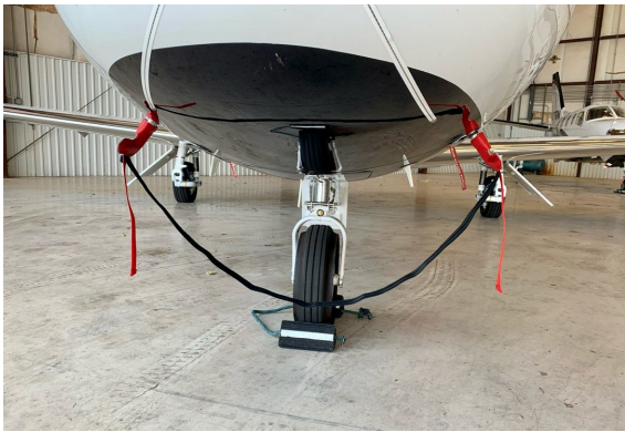
Cessna Citationjet CJ1 Pitot Cover Set