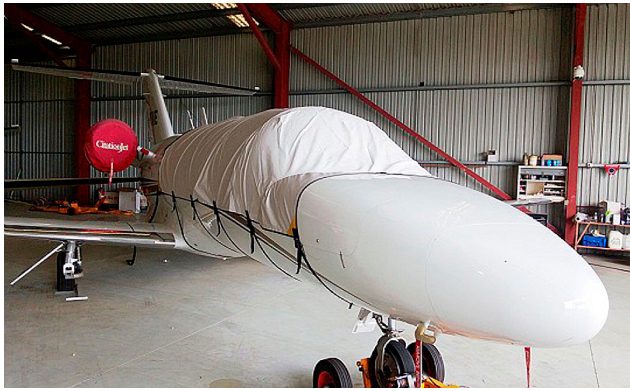
Citation CJ-1 Canopy Cover and Engine Covers