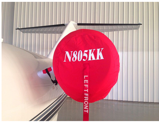
Cessna CJ1 Intake Cover and Inlet Plug