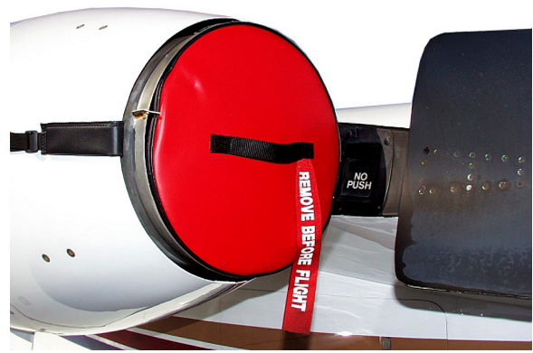
Engine Exhaust Plug