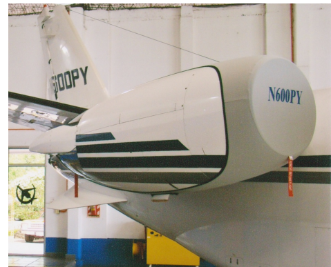
Citation XL Bikini Style Engine Covers