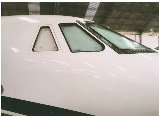
Citation XL Cockpit HeatShields