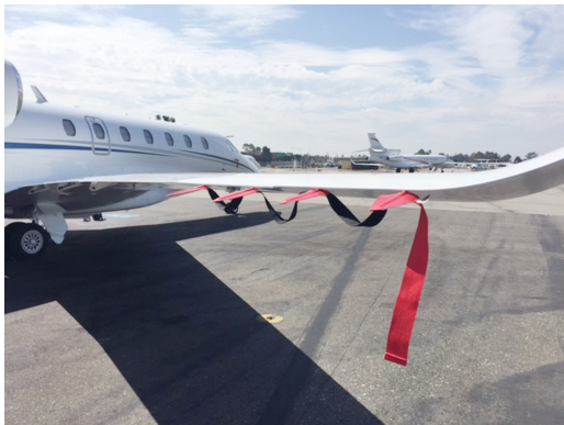
Citation X Static Wick Protectors

The Engine Exhaust Plugs are custom fit for your Cessna Citation X (750) exhaust openings, made with heavy-duty vinyl material, and stuffed with a single block of sculpted urethane foam. Each plug has a zipper that allows the foam to be removed and dried if necessary. Exhaust plugs have 'remove before flight' streamers sewn onto the face of the plugs. Most plugs are imprinted with the aircraft registration number in black for an extra charge. Exhaust plugs may be inserted soon after flight when the engine is still warm. Engine Inlet Plugs are commonly referred to as Cowl Plugs, Intake Plugs, Cowl Blocks, Engine Blocks, and Engine Bungs.