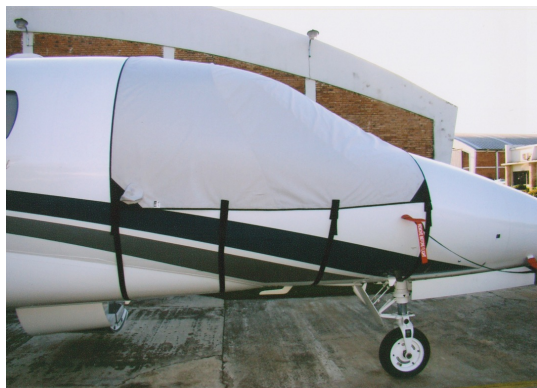
Citation XL Cockpit Cover

This cover type is made from Silver Acrylic Sunbrella canvas and is 100% lined with a soft and smooth microfiber. Bruce's Custom Covers developed this material combination especially for aircraft protection. The outer material is medium weight and treated for water resistance, UV resistance and anti-static buildup. The inner lining is a very soft and smooth microfiber to prevent scratching. The material is very reflective, and tests show that the cabin interior temperature can be reduced to near-ambient temperature on the hottest of days. It is water, ice and snow repellent, yet breathable to allow moisture to escape from between the cover and the aircraft surface.