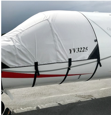
Cessna Citationjet V Ultra (560) Cockpit Cover

This cover type is made from Silver Acrylic Sunbrella canvas and is 100% lined with a soft and smooth microfiber. Bruce's Custom Covers developed this material combination especially for aircraft protection. The outer material is medium weight and treated for water resistance, UV resistance and anti-static buildup. The inner lining is a very soft and smooth microfiber to prevent scratching. The material is very reflective, and tests show that the cabin interior temperature can be reduced to near-ambient temperature on the hottest of days. It is water, ice and snow repellent, yet breathable to allow moisture to escape from between the cover and the aircraft surface.