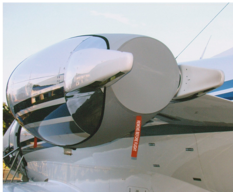
Citation XL Bikini Style Engine Covers

The Cessna Citation X (750) Intake Covers are designed to install easily yet be completely storable. A spring steel hoop is sewn into the hem of each cover, allowing them to be installed without climbing onto the wing or using a stepladder. To store the covers the spring steel hoop folds like a band-saw blade into three nesting rings. Each cover folds into a compact circular bundle which is stored in the included duffle bag, yet they unfold quickly for use. The Tri-Fold Ring cover is made of medium weight nylon which is available in a variety of colors to match the paint trim. Each cover set comes complete with installation and folding instructions. The aircraft's registration number can be silkscreened onto the cover for an extra charge.