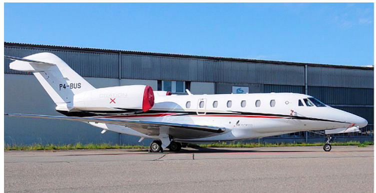
Citation X Intake & Pitot Tube Covers