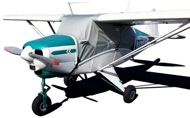
Tri-Pacer Over-the-Top Canopy Cover

occasional use outside. We also have an ultra lightweight material available for fitted hangar dust covers. For daily outdoor use, the non-travel Sunbrella Cover is the best choice.