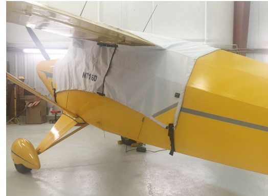
Piper Pacer Over-Top Canopy Cover