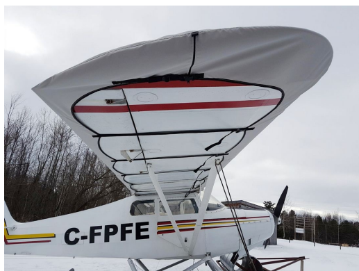
Christavia MK1 Wing Covers

WINTER USE MATERIAL - Made with Solution-Dyed Polyester fabric, this option is intended for seasonal use to aid in deicing, rain mitigation, or for occasional travel. The material is lighter and more compact, but more susceptible to UV damage and may have a shorter useful life if used continuously outside than the all-year use material.