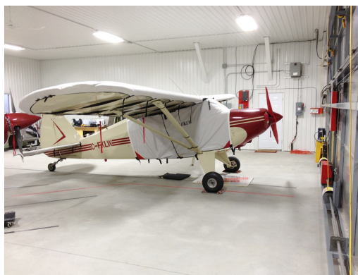
Piper PA-20 Extended Canopy Cover, Wing Covers