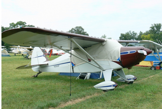
Piper Pacer Canopy Cover

This cover type is made from Silver Acrylic Sunbrella canvas and is 100% lined with a soft and smooth microfiber. Bruce's Custom Covers developed this material combination especially for aircraft protection. The outer material is medium weight and treated for water resistance, UV resistance and anti-static buildup. The inner lining is a very soft and smooth microfiber to prevent scratching. The material is very reflective, and tests show that the cabin interior temperature can be reduced to near-ambient temperature on the hottest of days. It is water, ice and snow repellent, yet breathable to allow moisture to escape from between the cover and the aircraft surface.