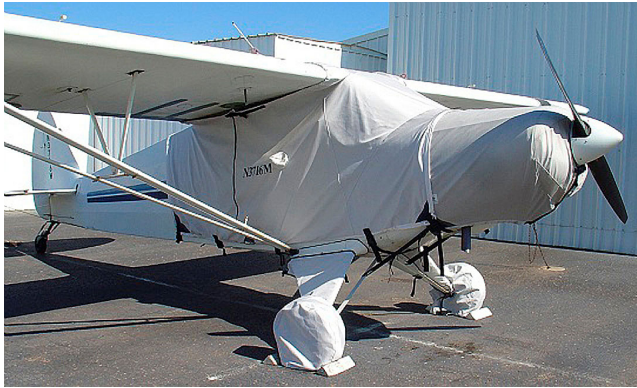
Piper PA-12 Extended Canopy, Engine & Landing Gear Covers

Insulated Covers Material - A special composite material of solution-dyed polyester, 3M Thinsulate insulation, and soft nylon interior fabric. Our insulated covers are designed to complement an engine preheater and help retain heat in the engine compartment after shutdown. If you operate your aircraft in cold-weather, these covers will help prevent engine wear and tear.