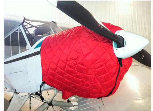
Piper Super Cub Insulated Engine Cover