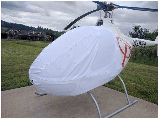
Guimbal Cabri G2 Bubble Cover, test fit cover