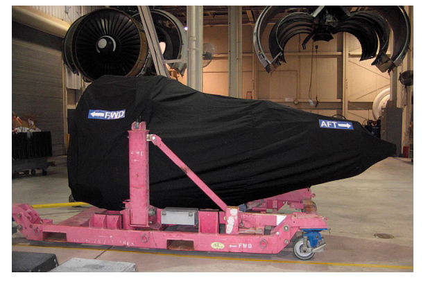
Cone, fully enclosed