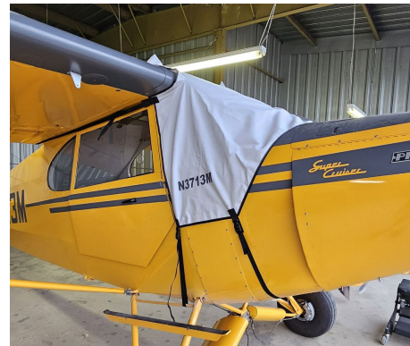
Piper PA-12: Super Cruiser, J5 Cub Windshield/Skylight Cover