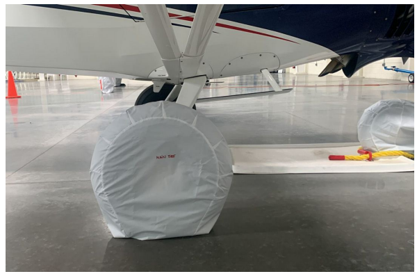
Cub Crafters Tire Covers, tricycle gear, test fit covers