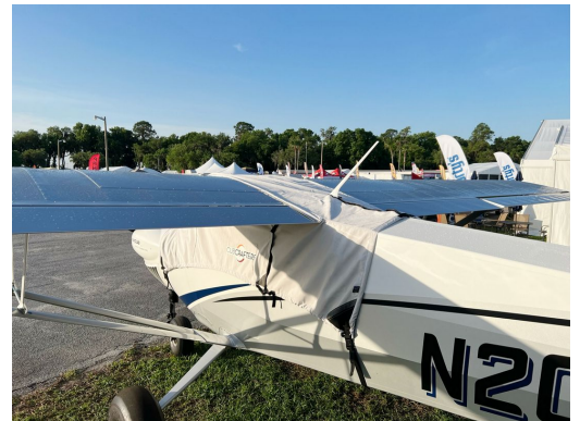
Cub Crafters CC-18 Canopy Cover