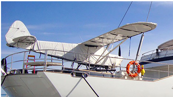
Piper PA-18 Super Cub Complete Cover set

WINTER USE MATERIAL - Made with Solution-Dyed Polyester fabric, this option is intended for seasonal use to aid in deicing, rain mitigation, or for occasional travel. The material is lighter and more compact, but more susceptible to UV damage and may have a shorter useful life if used continuously outside than the all-year use material.