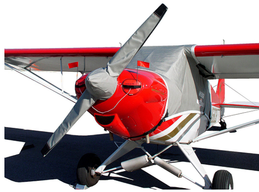
Cub Crafters Sport Cub Prop Cover & Engine Plugs