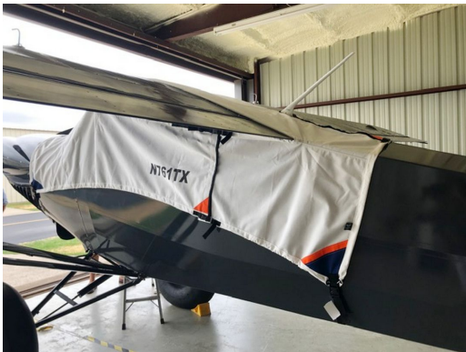
CubCrafters CCK-2000 Over The Top Canopy Cover

This cover type is made from Silver Acrylic Sunbrella canvas and is 100% lined with a soft and smooth microfiber. Bruce's Custom Covers developed this material combination especially for aircraft protection. The outer material is medium weight and treated for water resistance, UV resistance and anti-static buildup. The inner lining is a very soft and smooth microfiber to prevent scratching. The material is very reflective, white, and tests show that the cabin interior temperature can be reduced to near-ambient temperature on the hottest of days. It is water, ice and snow repellent, yet breathable to allow moisture to escape from between the cover and the aircraft surface.