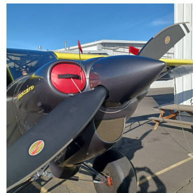
CubCrafters FX-3 Engine Inlet Plugs