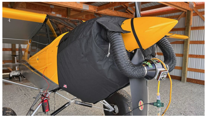
CubCrafters CCX-2000 Insulated Engine Cover