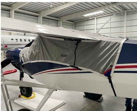
CubCrafters CCX-2300 Light Weight Travel Cover

This cover type is made from Silver Acrylic Sunbrella canvas and is 100% lined with a soft and smooth microfiber. Bruce's Custom Covers developed this material combination especially for aircraft protection. The outer material is medium weight and treated for water resistance, UV resistance and anti-static buildup. The inner lining is a very soft and smooth microfiber to prevent scratching. The material is very reflective, and tests show that the cabin interior temperature can be reduced to near-ambient temperature on the hottest of days. It is water, ice and snow repellent, yet breathable to allow moisture to escape from between the cover and the aircraft surface.