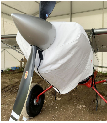
Cub Crafters CC-19 Engine Cover