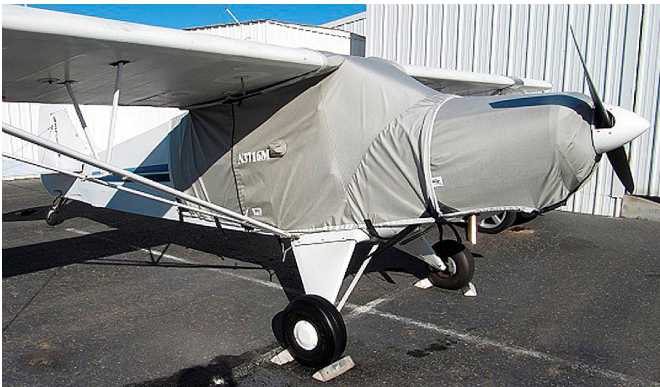
Piper PA-12 Super Cruiser Extended Over-the-Top Canopy Cover & Engine Cover

This cover type is made from Silver Acrylic Sunbrella canvas and is 100% lined with a soft and smooth microfiber. Bruce's Custom Covers developed this material combination especially for aircraft protection. The outer material is medium weight and treated for water resistance, UV resistance and anti-static buildup. The inner lining is a very soft and smooth microfiber to prevent scratching. The material is very reflective, and tests show that the cabin interior temperature can be reduced to near-ambient temperature on the hottest of days. It is water, ice and snow repellent, yet breathable to allow moisture to escape from between the cover and the aircraft surface.