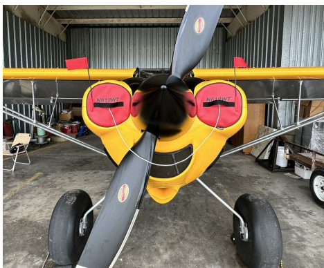
Cub Crafters CC-19 X-Cub Engine Plugs

Engine Inlet Plugs are custom fit for your CubCrafters CC-18, 19, 20, Top Cub, CCK-1865, CC-19 X-Cub, CCX-2000, EX-3, FX-3 intakes, made with heavy-duty vinyl material, and stuffed with a single block of sculpted urethane foam. Each plug has a zipper that allows the foam to be removed and dried if necessary. Engine plugs have warning flags that are visible from the cockpit or 'remove before flight' streamers sewn onto the face of the plugs. Most plugs are imprinted with the aircraft registration number in black for an extra charge. Storage bag NOT included. Engine plugs may be inserted after flight when the engine is still warm. Engine Inlet Plugs are commonly referred to as Cowl Plugs, Intake Plugs, Cowl Blocks, Engine Blocks, and Engine Bungs.