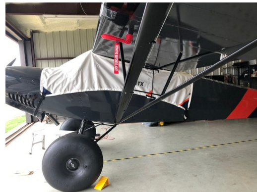
CubCrafters CCK-2000 Over The Top Canopy Cover, Pitot Cover