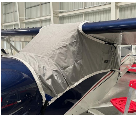
CubCrafters CCX-2300 Light Weight Travel Cover

This cover type is made from Silver Acrylic Sunbrella canvas and is 100% lined with a soft and smooth microfiber. Bruce's Custom Covers developed this material combination especially for aircraft protection. The outer material is medium weight and treated for water resistance, UV resistance and anti-static buildup. The inner lining is a very soft and smooth microfiber to prevent scratching. The material is very reflective, and tests show that the cabin interior temperature can be reduced to near-ambient temperature on the hottest of days. It is water, ice and snow repellent, yet breathable to allow moisture to escape from between the cover and the aircraft surface.