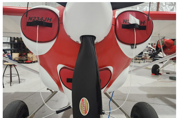
CubCrafters Carbon Cub Engine Plugs