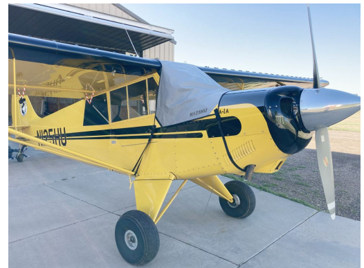
Aviat Husky Windshield/Skylight Cover