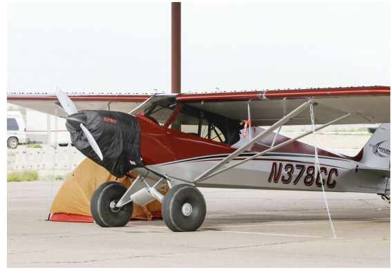
Cub Crafters CC11-160 Insulated Engine Cover