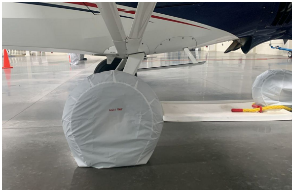
Cub Crafters Tire Covers, tricycle gear, test fit covers

ALL-YEAR USE MATERIAL - Made with Silver Acrylic Sunbrella canvas, the all-year use material is the best option for sun protection and cover longevity. This heavier more durable material is intended for all weather conditions, such as rain and snow or lots of sun.