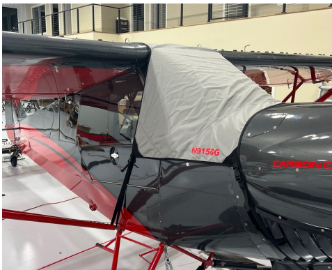
Cub Crafters CC11-004: WINDSHIELD/SKYLIGHT COVER

This cover type is made from Silver Acrylic Sunbrella canvas and is 100% lined with a soft and smooth microfiber. Bruce's Custom Covers developed this material combination especially for aircraft protection. The outer material is medium weight and treated for water resistance, UV resistance and anti-static buildup. The inner lining is a very soft and smooth microfiber to prevent scratching. The material is very reflective, and tests show that the cabin interior temperature can be reduced to near-ambient temperature on the hottest of days. It is water, ice and snow repellent, yet breathable to allow moisture to escape from between the cover and the aircraft surface.