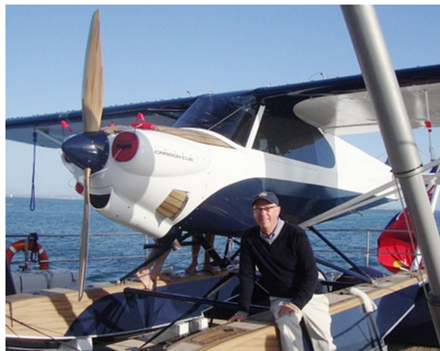
Cub Crafters CC-11 Engine Plugs

Engine Inlet Plugs are custom fit for your CubCrafters CC-11, Sport Cub S2, & Carbon Cub intakes, made with heavy-duty vinyl material, and stuffed with a single block of sculpted urethane foam. Each plug has a zipper that allows the foam to be removed and dried if necessary. Engine plugs have warning flags that are visible from the cockpit or 'remove before flight' streamers sewn onto the face of the plugs. Most plugs are imprinted with the aircraft registration number in black for an extra charge. Storage bag NOT included. Engine plugs may be inserted after flight when the engine is still warm. Engine Inlet Plugs are commonly referred to as Cowl Plugs, Intake Plugs, Cowl Blocks, Engine Blocks, and Engine Bungs.