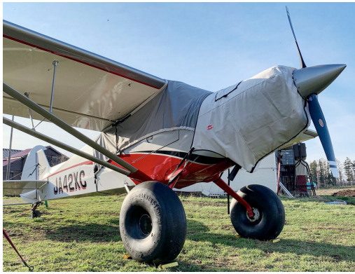
Cub Crafters CC19 X-Cub Engine Cover, Travel Weight Canopy Cover