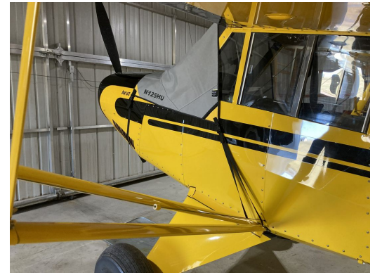
Aviat Husky Windshield/Skylight Cover