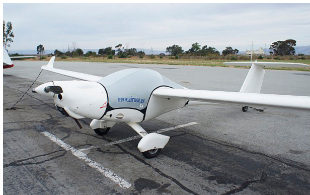
Lambda Canopy Cover