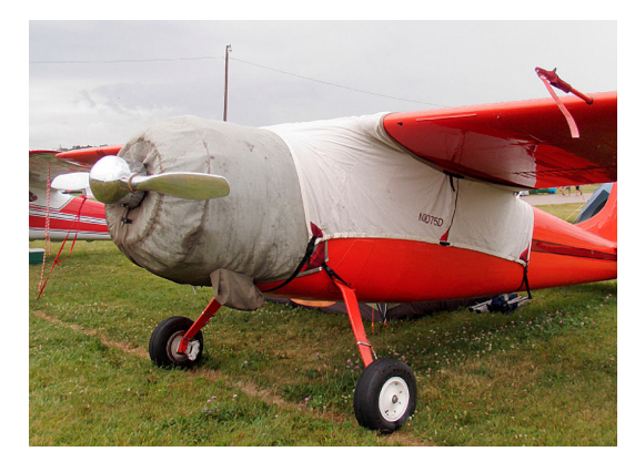
Cessna 195 Over-Top Canopy Cover & Engine Cover

The material is very reflective, and tests show that the cabin interior temperature can be reduced to near-ambient temperature on the hottest of days. It is water, ice and snow repellent, yet breathable to allow moisture to escape from between the cover and the aircraft surface.