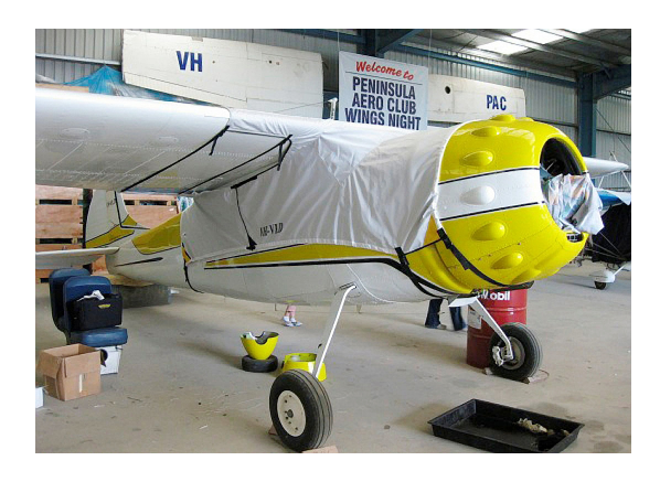
Cessna 195 Canopy Cover, over-top, 24" fwd ext to cover cowl ring gap, gas cap ext.