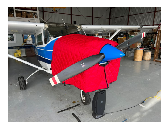
Insulated Hangar Blanket on Cessna 182